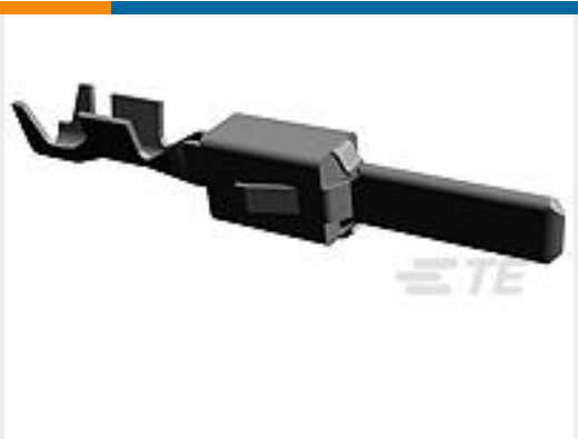
TE Part #1-962843-1 TAB 2.8x0.8 CONTACT CS SRC Sn