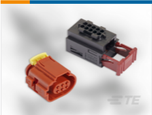
TE Part #1-967621-4 TIMER, CONNECTOR HOUSING