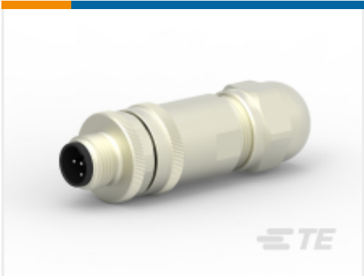
TE Part #T41111411051-000 M12 M, 5P GOLD B_CODE S SHIELDED PG7