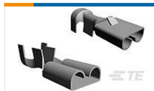
TE Part #2-180351-0 FF 250 REC 4-6MM2 TPPB