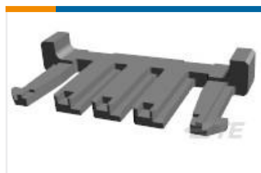
TE Part #917701-1 2.5 SIGNAL DBL LOCK DLP 5P