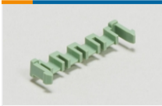
PCB Latches, Locks & Retainers(17)