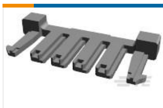
TE Part #917702-1 2.5 SIGNAL D//LOCK D.L.P 6P