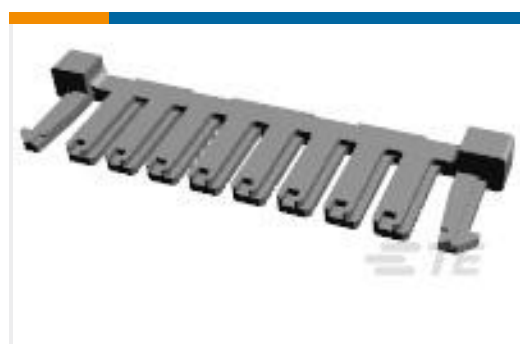
TE Part #917706-1 2.5 SIGNAL DBL LOCK DLP 10P