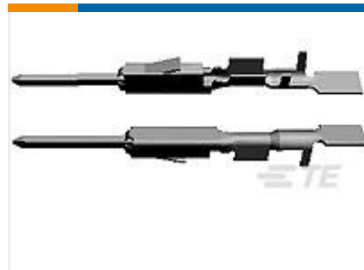
TE Part #2141828-1 MQS0,63 Sn tab LL unseal. 0,13-0,17