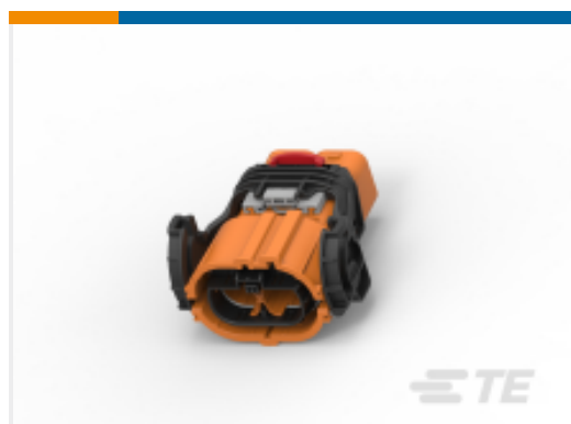
TE Part #1-2177053-2 2POS,8MM HV,PLUG HSG,ASSY, SEALED