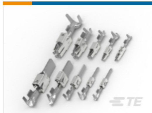
TE Part #965914-1 TIMER, RECEPTACLE AND TAB