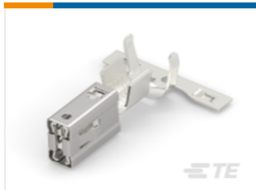
TE Part #1-1241418-3 AMP MCP 6.3/4.8K, CONTACT, SWS