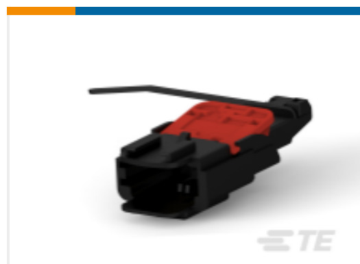
TE Part #2-953733-1 4W MCP TAB HSG LV ASSY