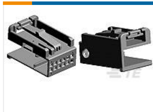
TE Part #1-1355524-3 MQS ABDECKKAPPE 12P