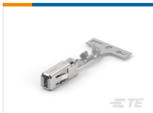
TE Part #1-2141857-1 AMP MCP 2.8, CONTACT