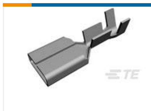
TE Part #1544132-2 CLIP 6,3 SECU 0,35