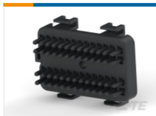
TE Part #1718601-1 COVER FOR FAM SEAL 58 POS NEW GEN