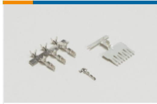
Busbars & Terminals(3)