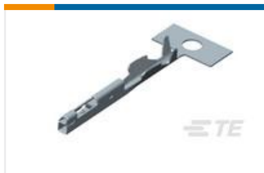
TE Part #2177909-1 MCON 0.50 TERMINAL