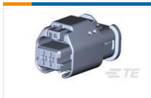
TE Part #1801175-7 2W RECEPTACLE HP CONNECTOR WHITE