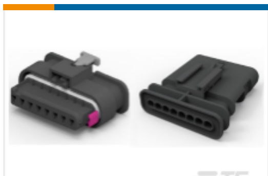
TE Part #1801606-3 MCON, CONNECTOR HOUSING