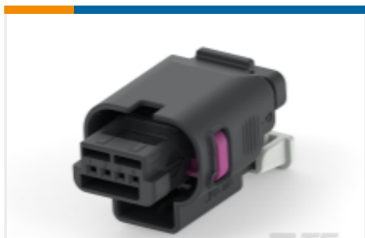
TE Part #1801823-1 4POS,MCON 0.5 CB,REC HSG,BLACK, ASSY,SLD