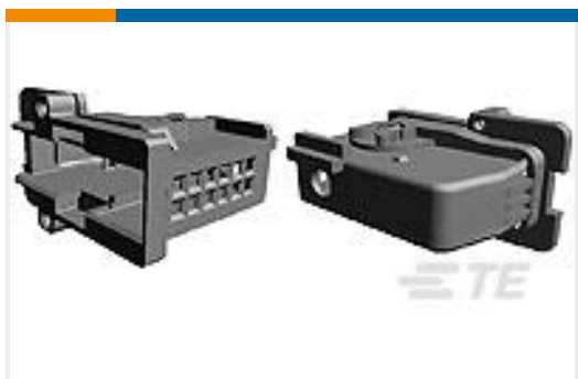
TE Part #1379095-2 COV+LEV MQS 12W 0DEG BLUE