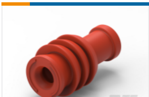
TE Part #963142-4 MQS SINGLE-WIRE SEAL FOR 4MM