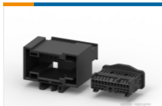
TE Part #953697-1 MQS, CONNECTOR HOUSING