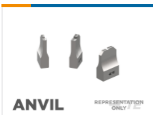
TE Part #3-1803057-3 ANVIL, COMBINATION