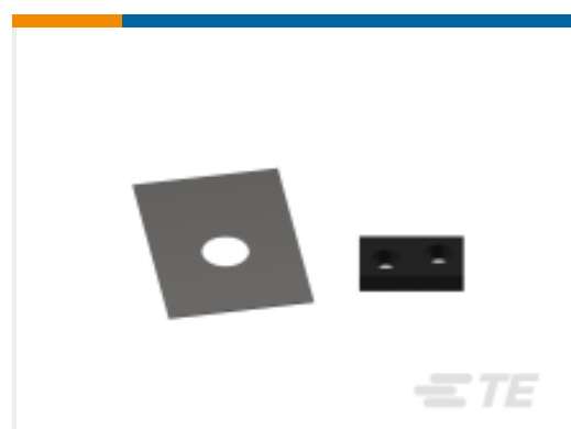
TE Part #238011-9 SPACER, BLOCK-CRIMPER (.114)