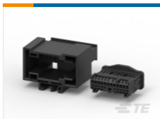
TE Part #953119-2 MQS, CONNECTOR HOUSING