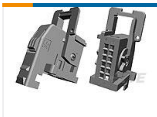
TE Part #1379096-1 COV+LEV MQS 12W 90DEG BRO