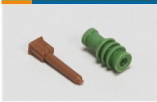
Automotive Seals & Cavity Plugs(26)