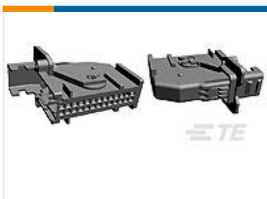
TE Part #185879-1 26W MQS COVER ASSY YELLOW