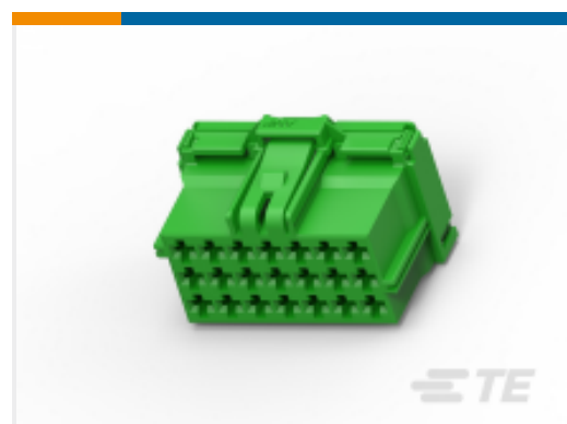
TE Part #1-2112891-2 AMP MCP, UNSEALED CONNECTOR HOUSING