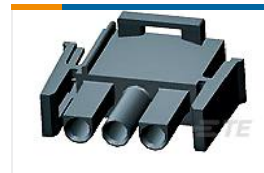
TE Part #2178473-2 3POS UMNL PLUG HSG V0 GW