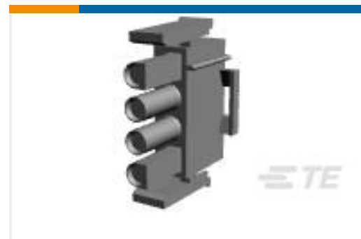
TE Part #1-480702-0 04P UMNL PLUG HSG NATL