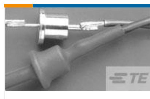
TE Part #8638624002 RNF-3000-18/6-0-SP