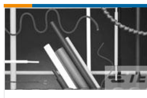
TE Part #5069844021 CGPT-6.4/3.2-0-SP