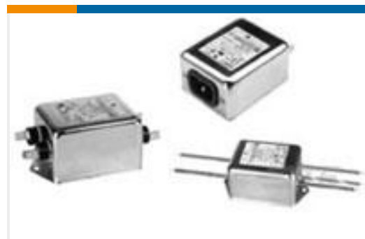
TE Part #1-6609035-2 10ESK7M=F7233 S0