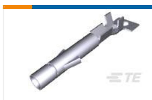
TE Part #926884-3 UNIV.M-M-L.SOCKET