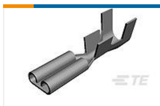
TE Part #41772-1 250 FASTON REC 22-18 AWG BR