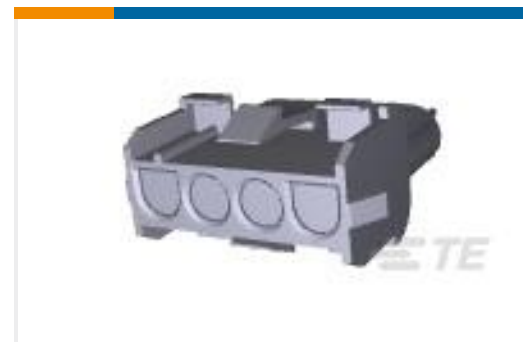
TE Part #350780-1 04P UMNL CAP HSG