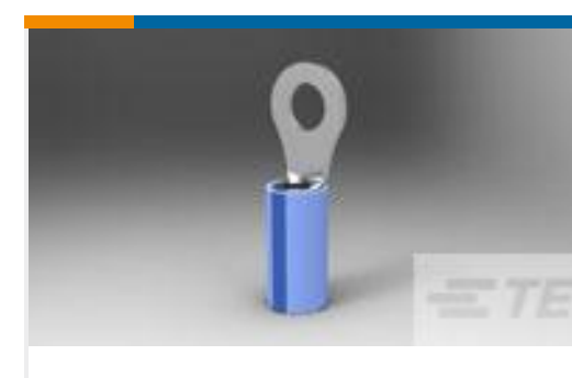
TE Part #1-51864-0 TERMINAL,PIDG R IR 16 8