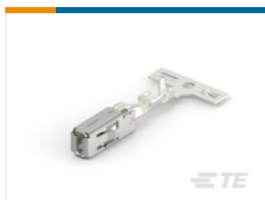
TE Part #1-2141857-3 AMP MCP 2.8, CONTACT