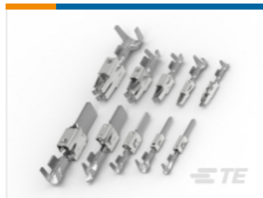
TE Part #969022-1 TIMER, RECEPTACLE AND TAB