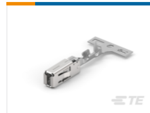
TE Part #1-2141857-1 AMP MCP 2.8, CONTACT