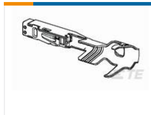
TE Part #2141970-3 MCON 1.2 LL REC SWS AG