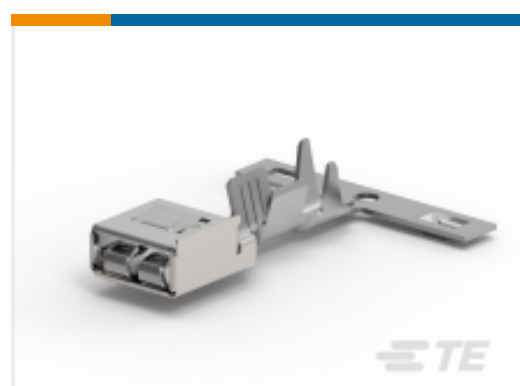
TE Part #968072-3 PQ5,2 Ag rec LL unseal. >1,0-2,5