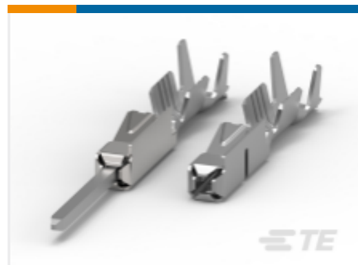
TE Part #2-1703930-2 MOS, RECEPTACLE AND TAB