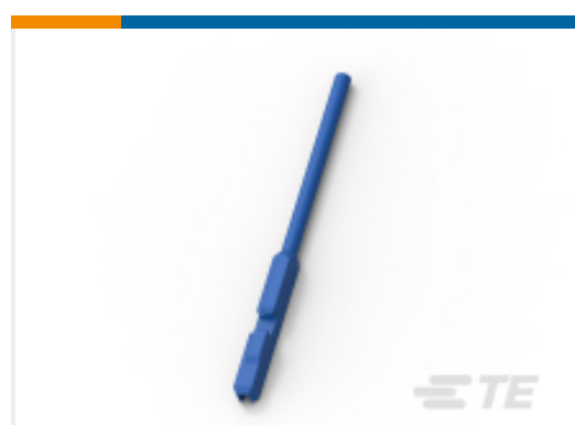
TE Part #2141276-1 BLIND PLUG DIA 63, MOS CB, SHORT