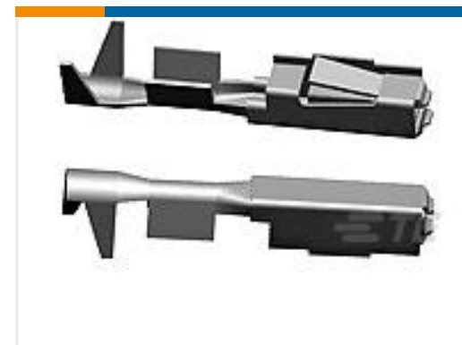
TE Part #929008-2 MOS1MM BU-KONT 90GR