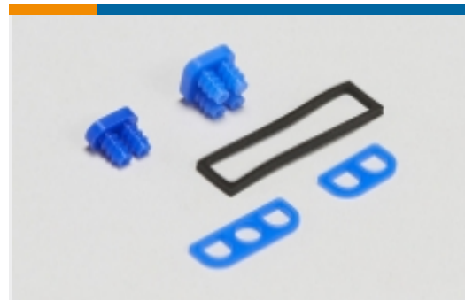
Rectangular Connector Seals(10)