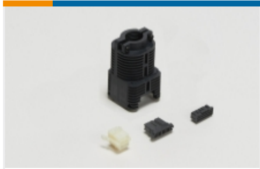
Rectangular Connector Housings(23)