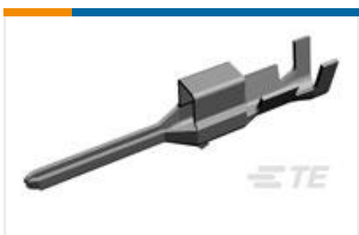
TE Part #917765-1 2.5 SIGNAL D/LOCK TAB CONT. M