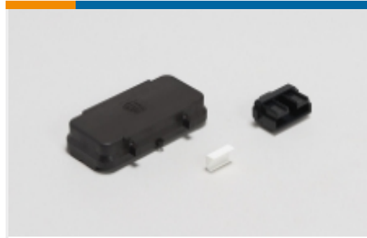
Rectangular Caps & Covers(1)