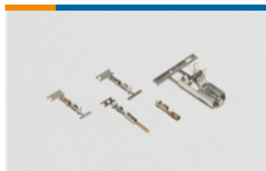
Wire-to-Board Connector Contacts(6)