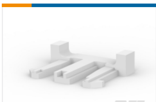
TE Part #917705-1 Signal Double Lock TPA