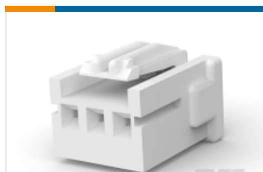
TE Part #917690-1 STD Temp Signal Double Lock Plug