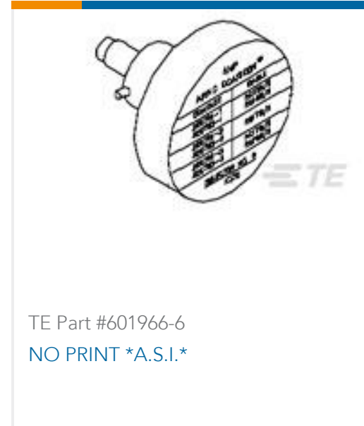
TE Part #601966-6 NO PRINT *A.S.I.*