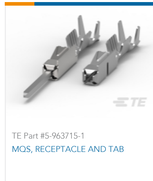
TE Part #5-963715-1 MQS, RECEPTACLE AND TAB