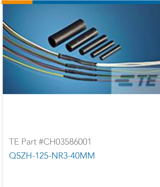
TE Part #CH03586001 QSZH-125-NR3-40MM