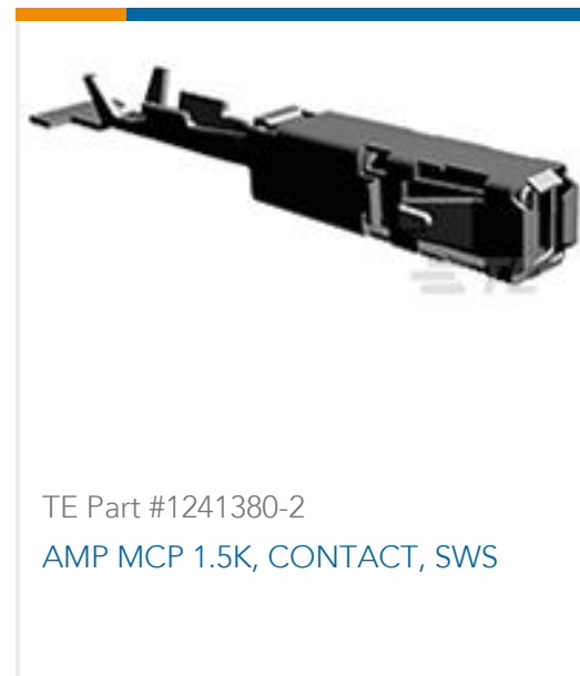
TE Part #1241380-2 AMP MCP 1.5K, CONTACT, SWS