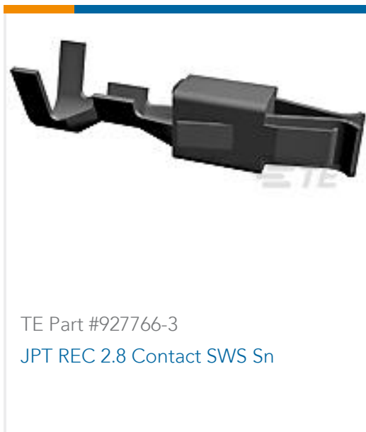
TE Part #927766-3 JPT REC 2.8 Contact SWS Sn