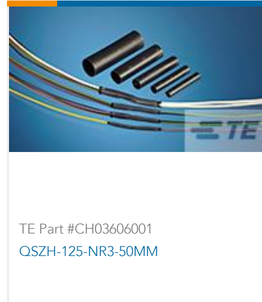
TE Part #CH03606001 QSZH-125-NR3-50MM