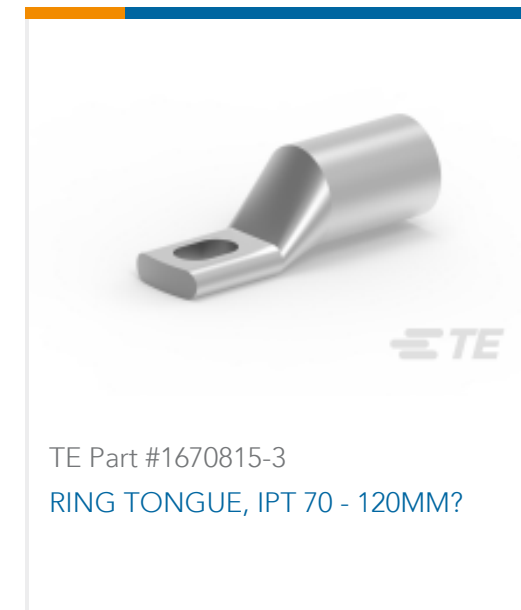
TE Part #1670815-3 RING TONGUE, IPT 70 - 120MM?