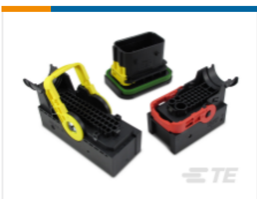
TE Part #1-1823440-3 LEAVYSEAL HOUSINGS