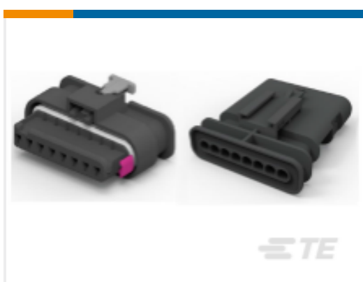
TE Part #1-2236343-1 MCON, CONNECTOR HOUSING