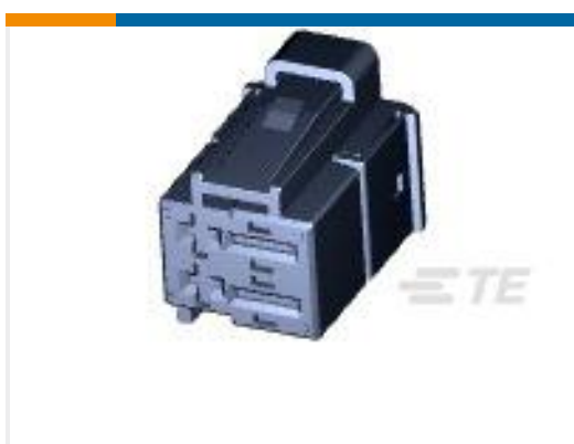
TE Part #1-1418507-2 SOCKET HSG 4POS.,AMP MCP2.8 /MCP6.3K