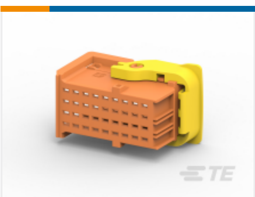
TE Part #1-1718485-6 CARRIER FOR RECEPT. INSERTS 36 POS