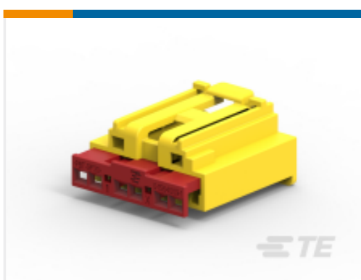
TE Part #1564003-1 6POS,GET 0.64,REC HSG,ASSY