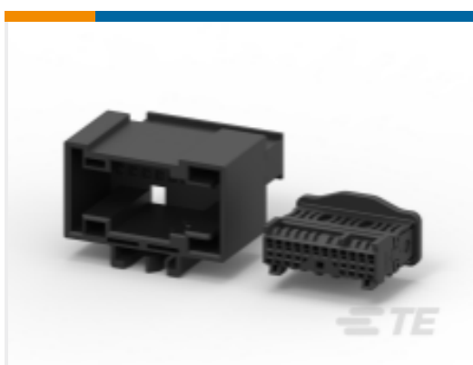
TE Part #1-967616-2 MQS, CONNECTOR HOUSING