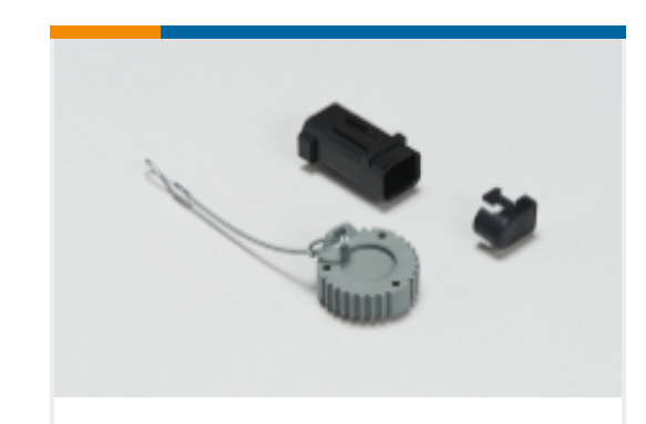
Automotive Connector Caps & Covers