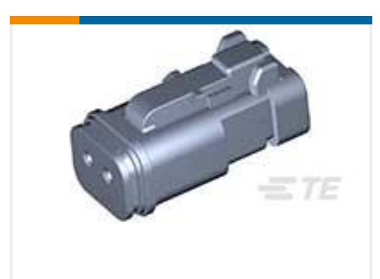
TE Part #DT06-2S-P060 PLG, 2P, BLK, BUSBAR 1X2, NICKEL