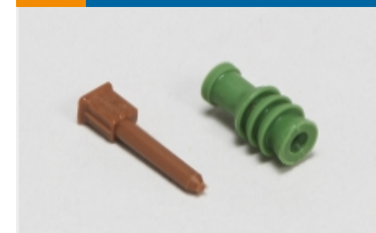
Automotive Seals & Cavity Plugs(3)