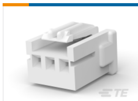
TE Part #917690-1 STD Temp Signal Double Lock Plug