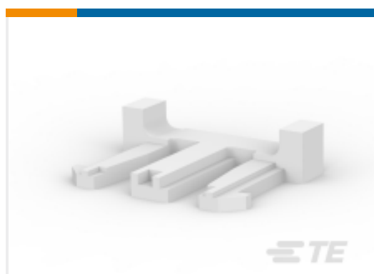
TE Part #917702-1 Signal Double Lock TPA