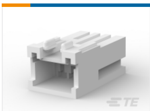
TE Part #316088-1 STD Temp Signal Double Lock Cap