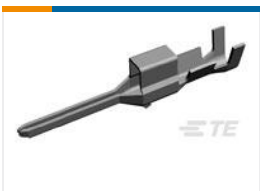
TE Part #917765-1 2.5 SIGNAL D/LOCK TAB CONT. M