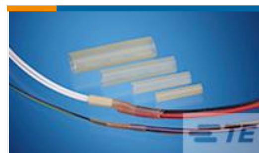
TE Part #0838016002 RBK-VWS-125-NR1-X-50MM