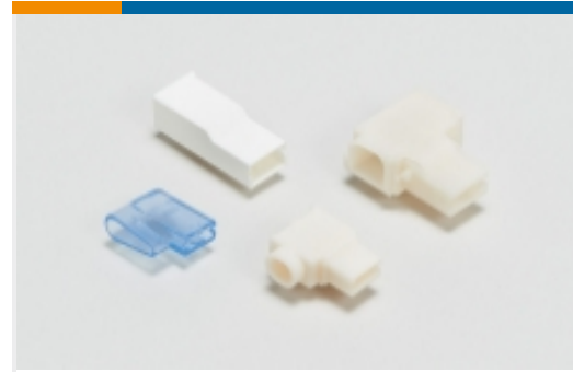
Crimp Terminal Housings(13)