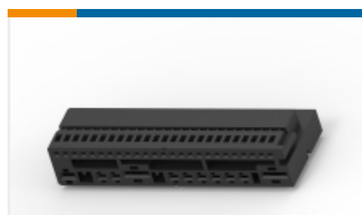
TE Part #2112675-1 36POS MIXED MQS REC COD A