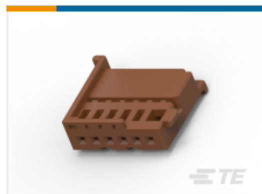
TE Part #1-969489-2 6POS MQS REC COD A