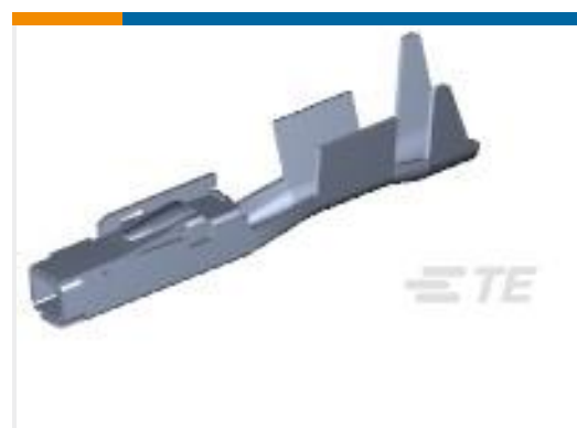
TE Part #7-1452659-1 MCON 1.2 LL REC SRC SN