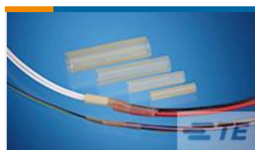
TE Part #3257456008 RBK-VWS-125-NR2-X-25MM