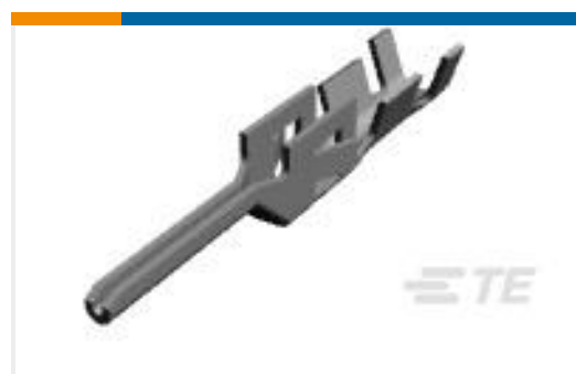
TE Part #1-794612-0 PIN CONT 20-24 TIN PLATE L/P