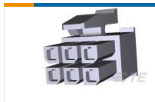
TE Part #794617-6 6POS,MICRO MNL,RCPT HSG