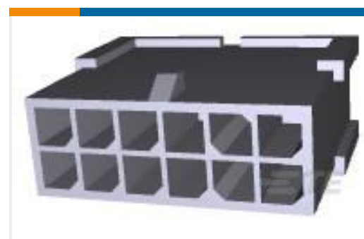
TE Part #1-794616-2 FREE HANG DBL ROW HSG 12 POS