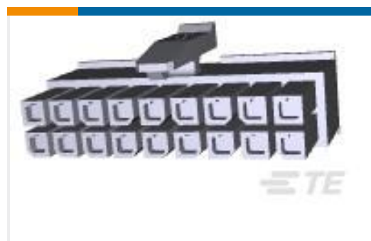
TE Part #1-794617-8 18POS,MICRO MNL,RCPT HSG