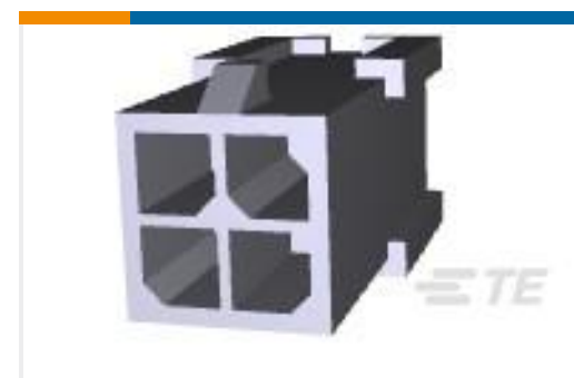
TE Part #794616-4 FREE HANG DBL ROW HSG 4 POS