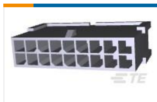
TE Part #1-794616-8 FREE HANG DBL ROW HSG 18 POS