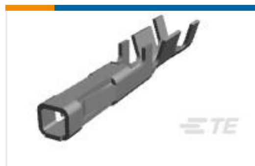
TE Part #1-794610-2 MICRO MNL RPT CNT,LS PC 30AU L