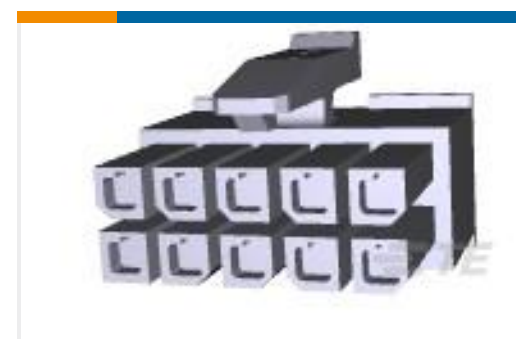
TE Part #1-794617-0 10POS,MICRO MNL,RCPT HSG