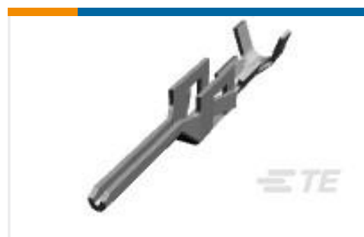
TE Part #1-794613-2 PIN CONT 26-30 30 GOLD L/P