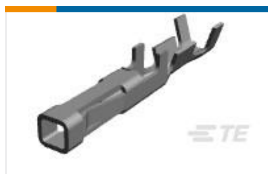
TE Part #794607-1 MICRO MNL RPT CNT STRIP 26-30