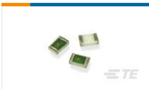
TE Part #2176091-8 RP 2A 0.25W 68R1 0.1% 25PPM 1K RL