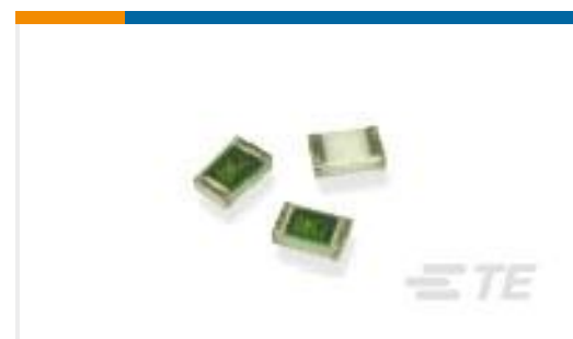
TE Part #7-2176088-6 RP 1J 0.166W 5K49 0.1% 25PPM 1K RL