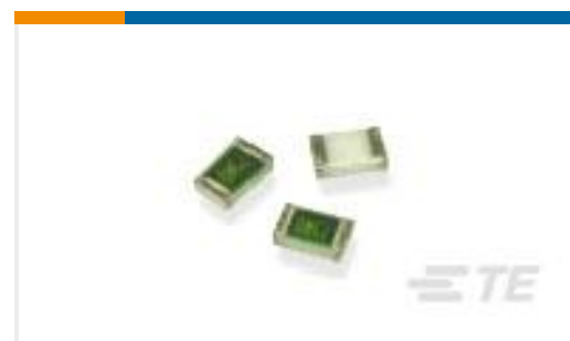
TE Part #1676201-2 RN 0805 165R 0.1% 10PPM 1KRL