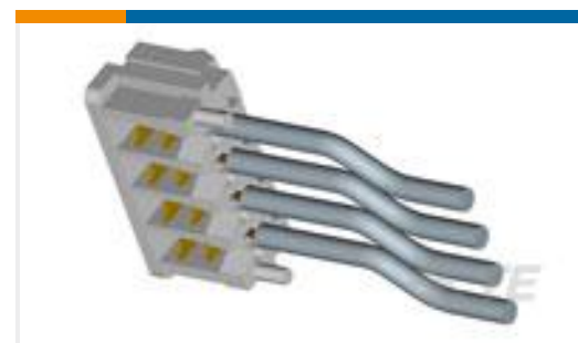
TE Part #173977-7 CT CONN MT REC ASSY 7P