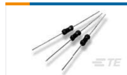
TE Part #5-1879355-8 RR03 5% 1M0 AMMO