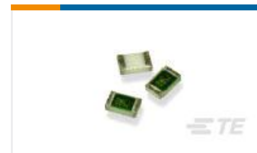
TE Part #9-1879214-0 CPF 0402 3K16 0.1% 25PPM 1K RL