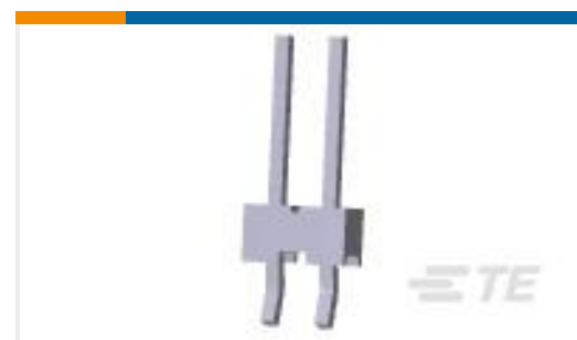
TE Part #3-644695-2 02P MTA100 STR HDR RETENTIVE