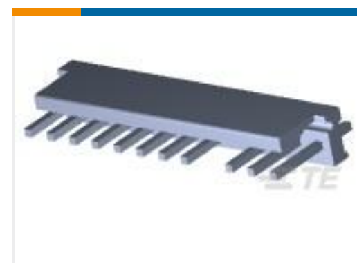
TE Part #641876-3 12P MTA156 HDR ASSY FL STR SN