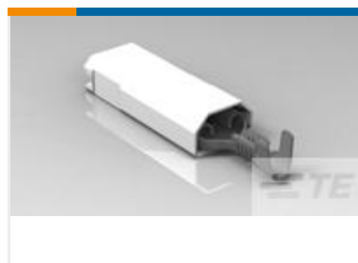
TE Part #521368-2 ULTRA-POD 250 ASSY REC 22-18 AWG TPBR