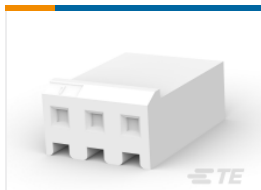
TE Part #770849-8 3.96mm Wire-to-board housing: receptacle, with mating alignment, SL 156