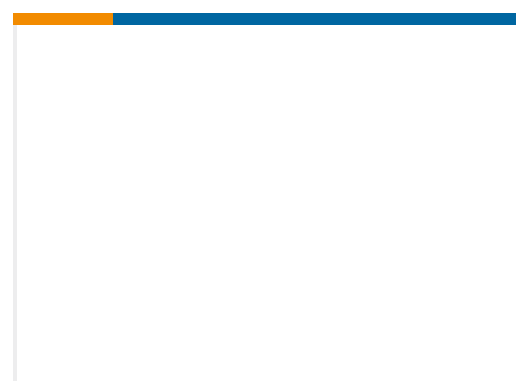
TE Part #A1004SS22P63 NTC Thermistor Probe, Swaged-E