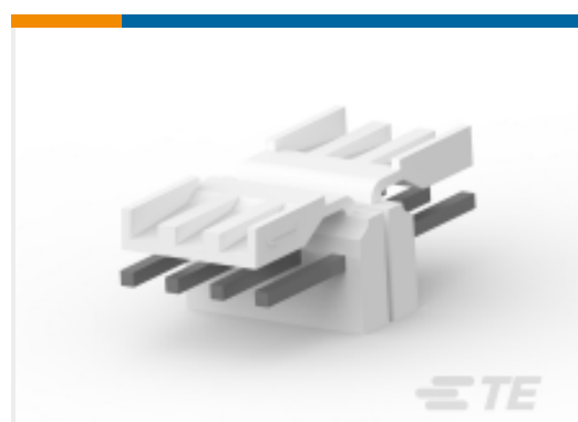
TE Part #1744001-4 04P MTA156 HDR POL .045SQ TIN