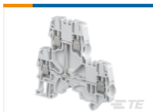
TE Part #1SNK506214R0000 ZS6-D1-RD