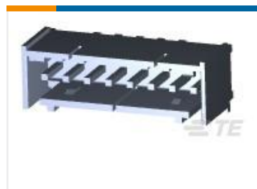
TE Part #644590-1 08P DUAL ROW R/A SHRD HDR SPCL