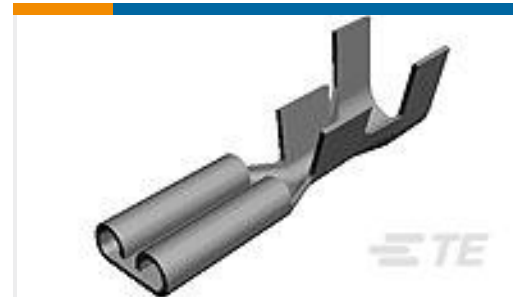
TE Part #626041-1 110 FASTON REC 22-16 AWG BR