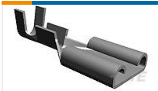
TE Part #42617-1 187 FASTON REC 20-16 AWG BR