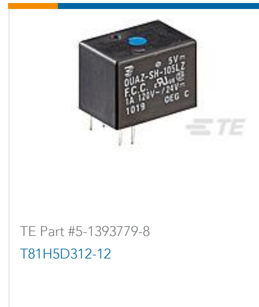
TE Part #5-1393779-8 T81H5D312-12