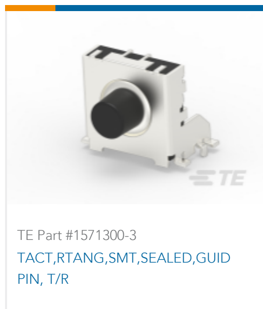
TE Part #1571300-3 TACT,RTANG,SMT,SEALED,GUID PIN, T/R