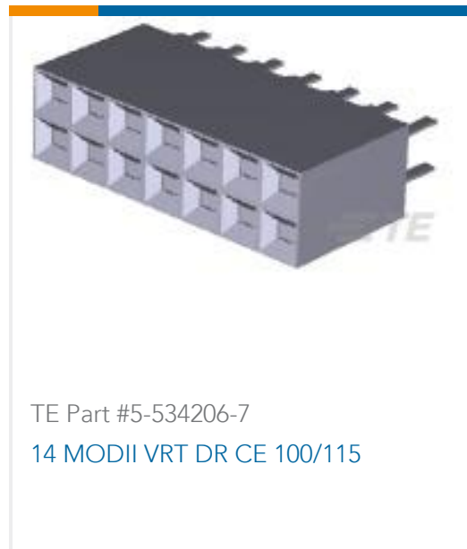
TE Part #5-534206-7 14 MODII VRT DR CE 100/115