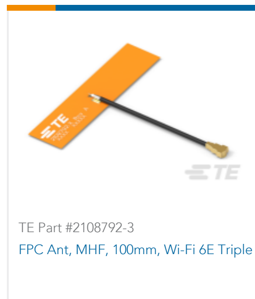
TE Part #2108792-3 FPC Ant, MHF, 100mm, Wi-Fi 6E Triple PIN, T/R