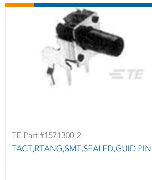
TE Part #1571300-2 TACT,RTANG,SMT,SEALED,GUID PIN