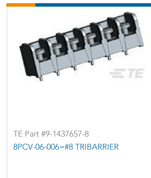
TE Part #9-1437657-8 8PCV-06-006=#8 TRIBARRIER