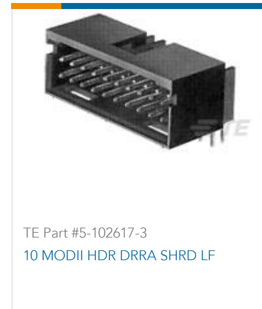
TE Part #5-102617-3 10 MODII HDR DRRA SHRD LF