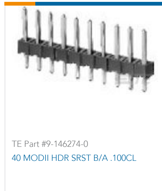
TE Part #9-146274-0 40 MODII HDR SRST B/A .100CL