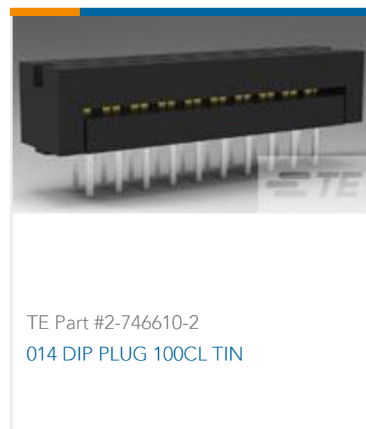
TE Part #2-746610-2 014 DIP PLUG 100CL TIN