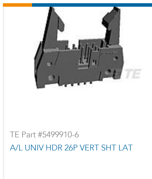
TE Part #5499910-6 A/L UNIV HDR 26P VERT SHT LAT