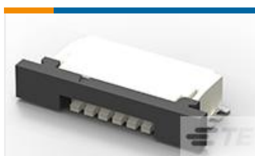
TE Part # 1735265-5 1MM FPC HORZ.BOTTOM CONT. ASSY 5P (Au)