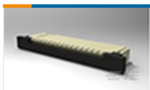
TE Part # 84953-5 1MM FPC HORZ.TOP CONT.ASSY 5P