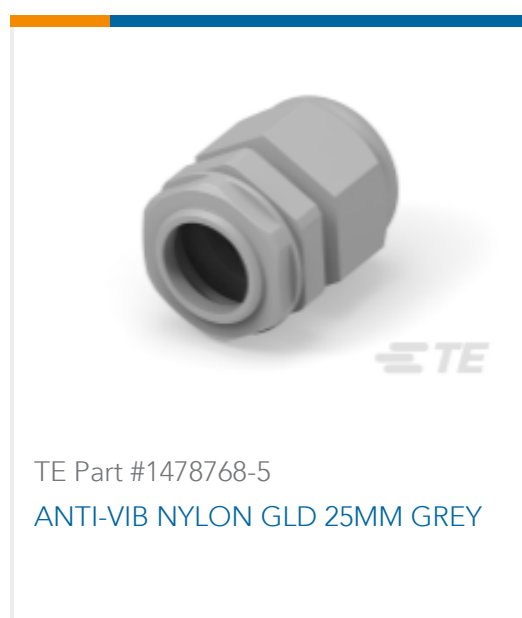
TE Part #1478768-5 ANTI-VIB NYLON GLD 25MM GREY