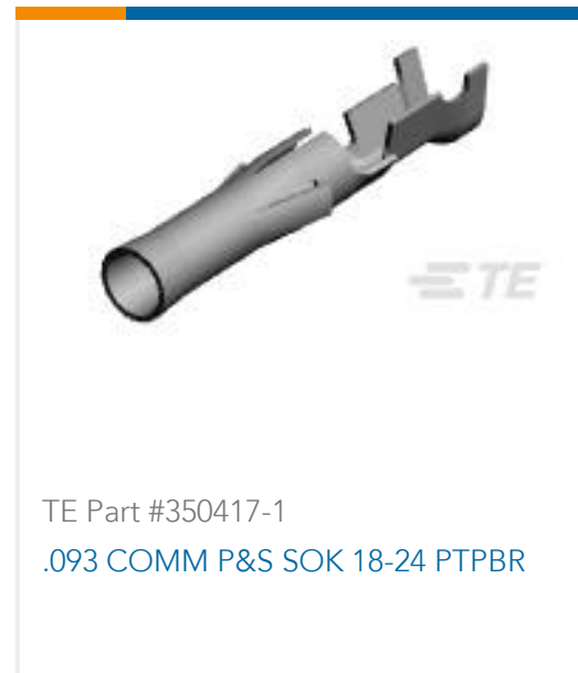
TE Part #350417-1 .093 COMM P&S SOK 18-24 PTPBR