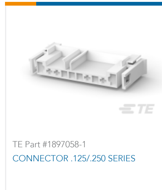
TE Part #1897058-1 CONNECTOR .125/.250 SERIES