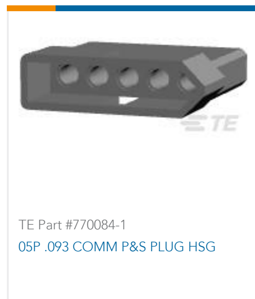
TE Part #770084-1 05P .093 COMM P&S PLUG HSG