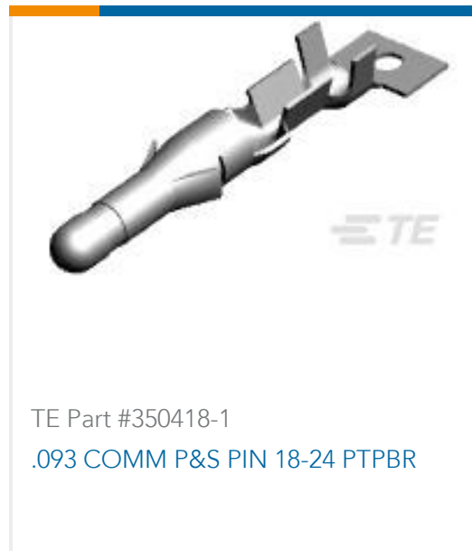
TE Part #350418-1 .093 COMM P&S PIN 18-24 PTPBR