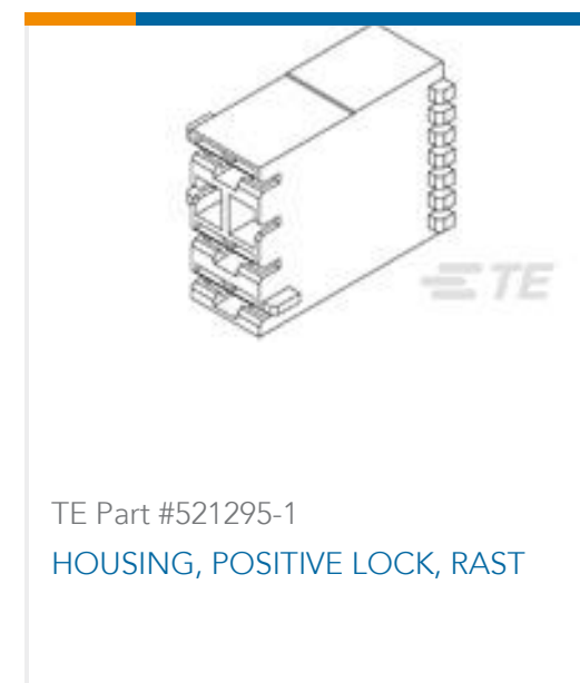
TE Part #521295-1 HOUSING, POSITIVE LOCK, RAST