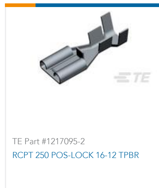
TE Part #1217095-2 RCPT 250 POS-LOCK 16-12 TPBR