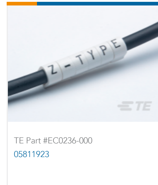
TE Part #EC0236-000 05811923