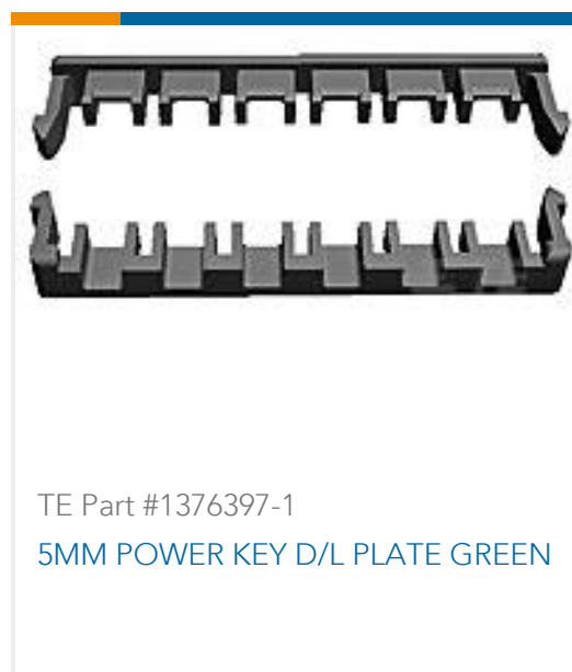
TE Part #1376397-1 5MM POWER KEY D/L PLATE GREEN