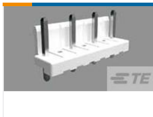
TE Part #6-1123724-2 3.96EP HDR ASSY 2(3)P GREEN