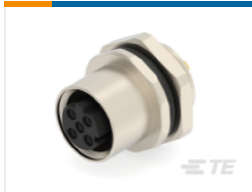
TE Part #T4133512041-000 M12,FRONT MOUNT,FEMALE,D,4P, SOLDER WIRE