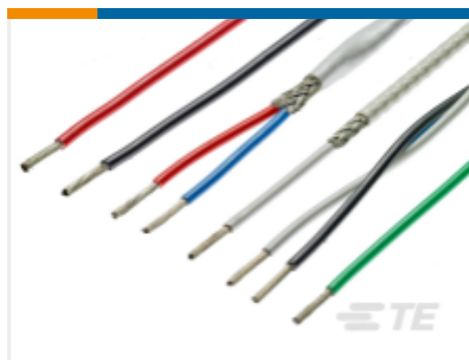
TE Part #3827113001 44A1121-20-2/9-9