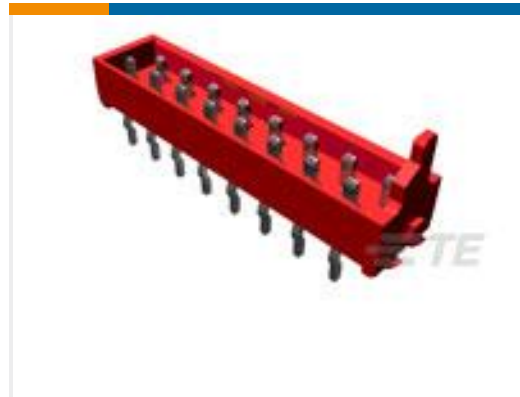
TE Part #2-215464-0 20P.MICRO-MATCH MOB