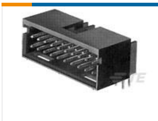
TE Part #5-87579-5 16 MODII HDR DRRR SHRD LF