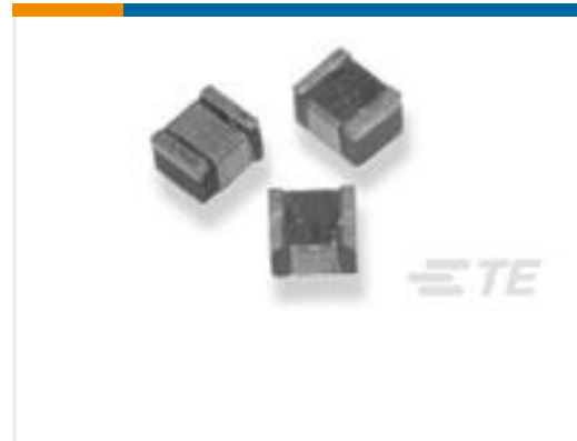
TE Part #1624112-7 3650 0603 47nH 5% 2K RL