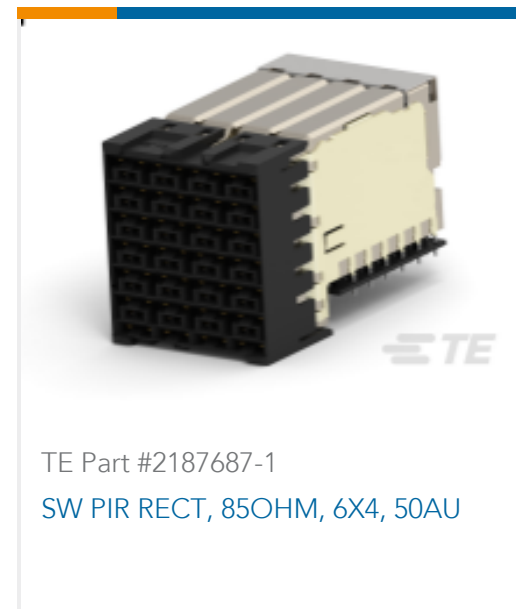
TE Part #2187687-1 SW PIR RECT, 85OHM, 6X4, 50AU