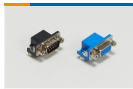
PCB D-Sub Connectors(8)