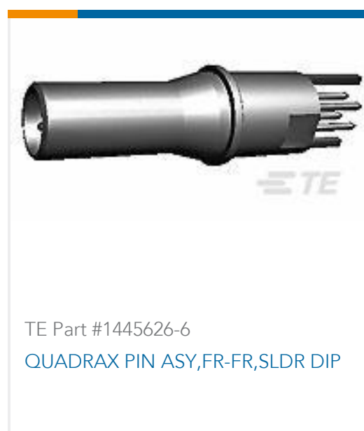
TE Part #1445626-6 QUADRAX PIN ASY,FR-FR,SLDR DIP