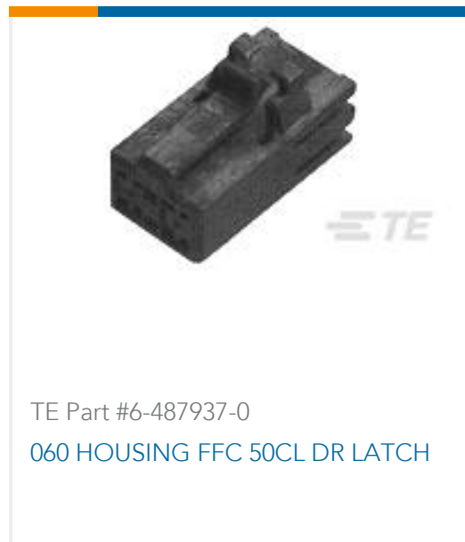
TE Part #6-487937-0 060 HOUSING FFC 50CL DR LATCH