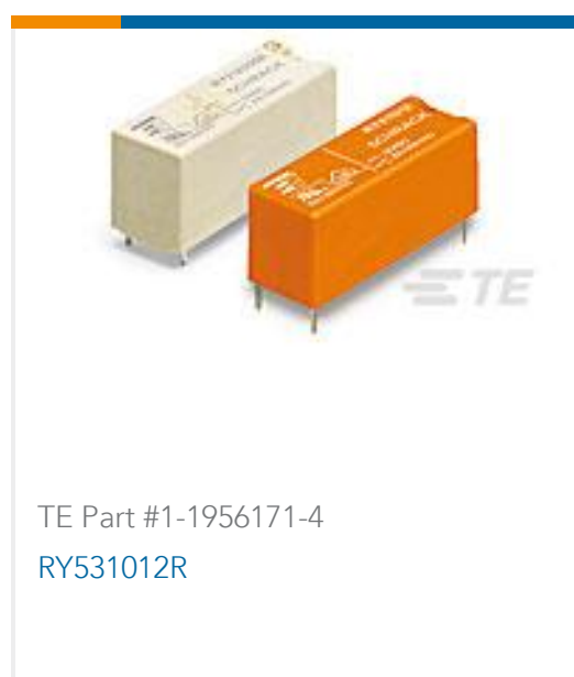
TE Part #1-1956171-4 RY531012R