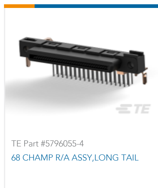
TE Part #5796055-4 68 CHAMP R/A ASSY, LONG TAIL