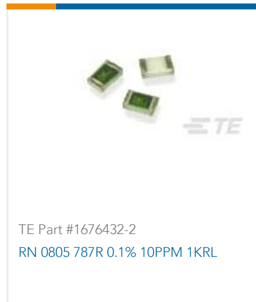
TE Part #1676432-2 RN 0805 787R 0.1% 10PPM 1KRL