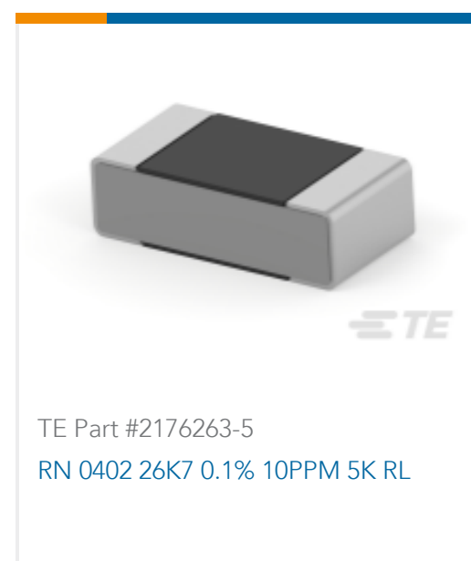
TE Part #2176263-5 RN 0402 26K7 0.1% 10PPM 5K RL