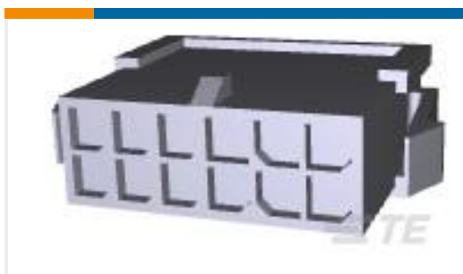
TE Part #1-794615-2 PANEL MT DBL ROW HSG 12 POS