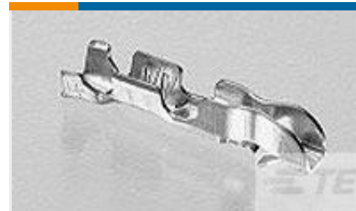
TE Part #170205-3 EIS CONTACT LP