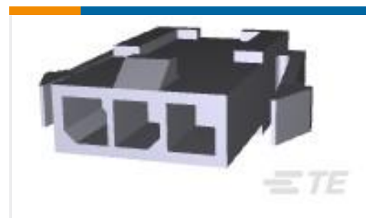
TE Part #1445048-3 PANEL MT SNGL ROW HSG 3 POS