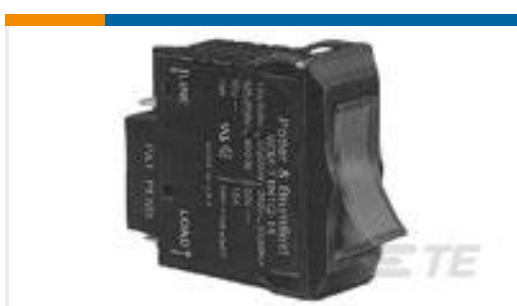
TE Part #2-1393248-5 W33-S4B1Q-10=W33