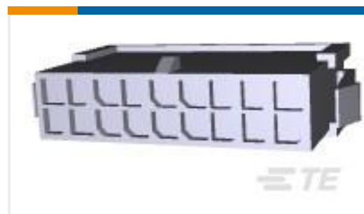
TE Part #1-794615-8 PANEL MT DBL ROW HSG 18 POS