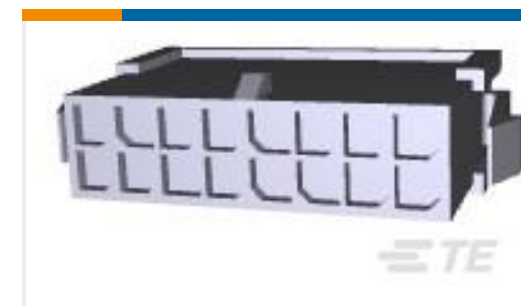
TE Part #1-794615-6 PANEL MT DBL ROW HSG 16 POS