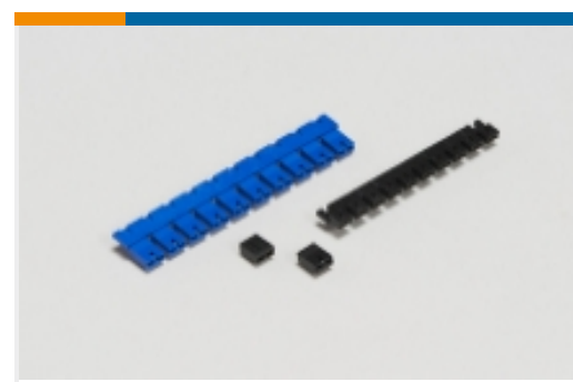
Board-to-Board Jumpers &amp; Shunts(5)