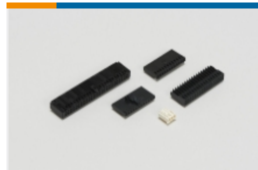
Wire-to-Board Connector Assemblies & Housings(44)