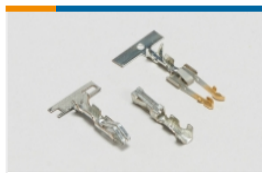
Board-to-Board Connector Contacts (104)