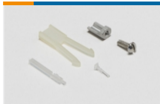
PCB Connector Keying(2)