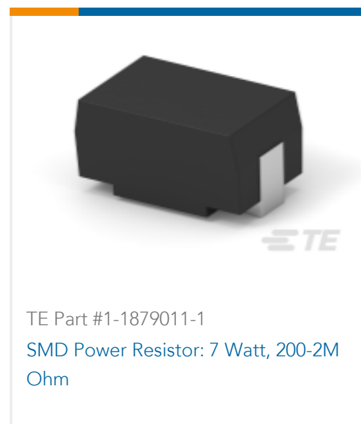
TE Part #1-1879011-1 SMD Power Resistor: 7 Watt, 200-2M Ohm