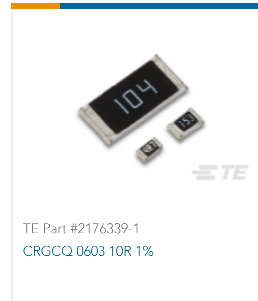
TE Part #2176339-1 CRGCQ 0603 10R 1%