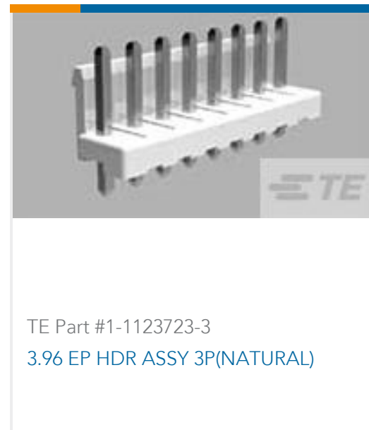
TE Part #1-1123723-3 3.96 EP HDR ASSY 3P(NATURAL)