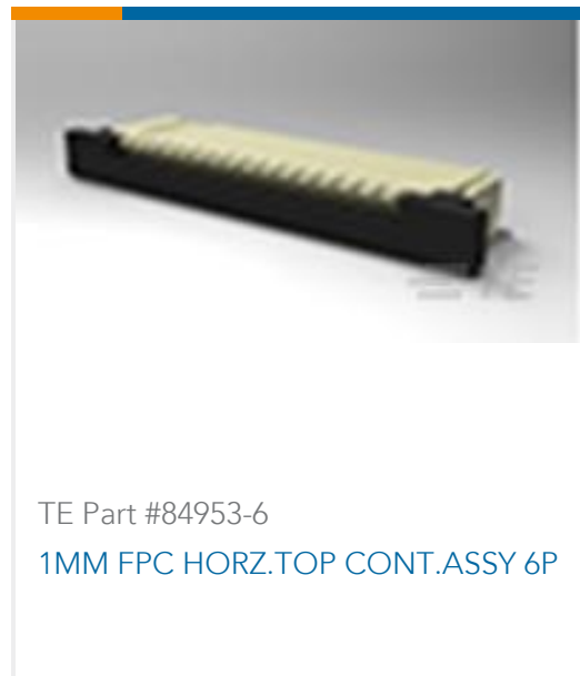
TE Part #84953-6 1MM FPC HORZ.TOP CONT.ASSY 6P