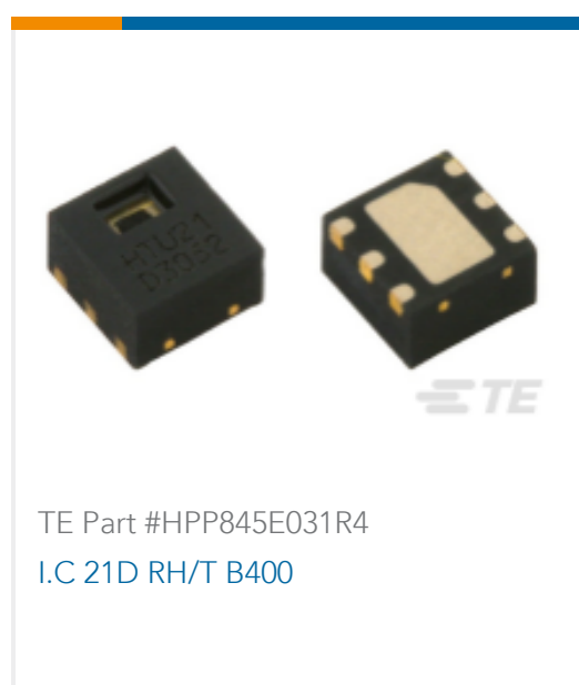
TE Part #HPP845E031R4 I.C 21D RH/T B400