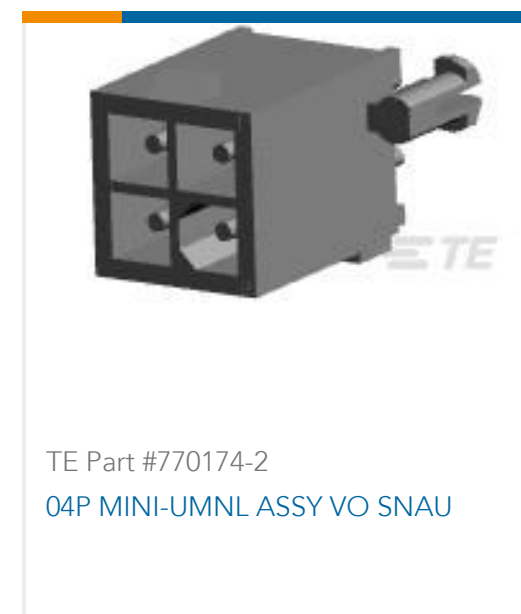
TE Part #770174-2 04P MINI-UMNL ASSY VO SNAU