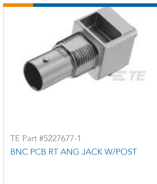
TE Part #5227677-1 BNC PCB RT ANG JACK W/POST