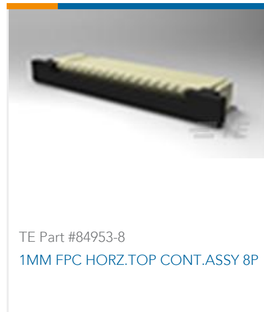
TE Part #84953-8 1MM FPC HORZ.TOP CONT.ASSY 8P