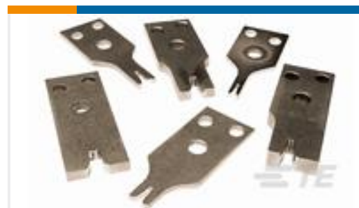
TE Part #1-1633961-2 CRIMPER, INSULATION F PREMIUM