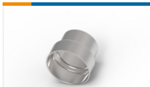
TE Part #2177090-3 STEEL, OUTER FERRULE, 8MM HV, 25SQMM