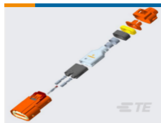
TE Part #YHV280-2PM-P-4MM-B HVA280-2phm,pass,4sqmm,Key B