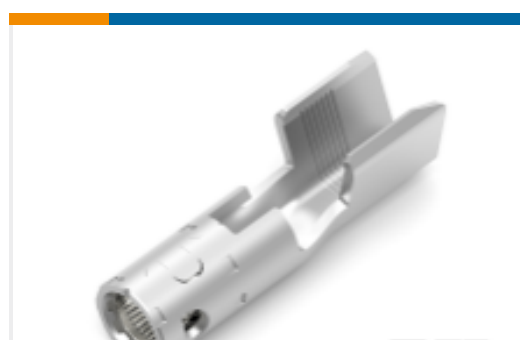
TE Part #2208669-3 8MM HV, CONTACT, ASSY