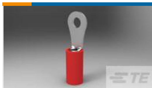
TE Part #2-330648-1 PIDG 22-16 22-18 MIL R 4; TAPE