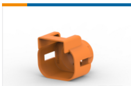
TE Part #2103013-3 CABLE SEAL RETAINER, SIZE 2, OR, HVA280