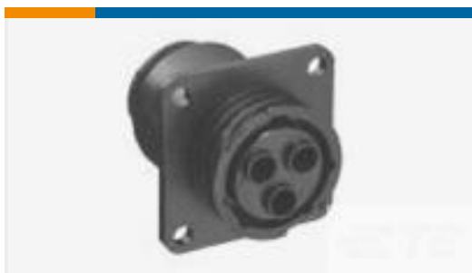
TE Part #788189-2 CPC 17-3 RCPT ASY,REV SEX