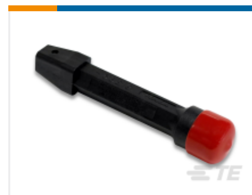
TE Part # 91285-1 INSERT/EXTRACT TOOL ASSEMBLY