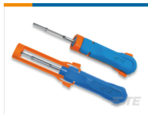
TE Part # 1579007-9 EXTRACTION TOOL