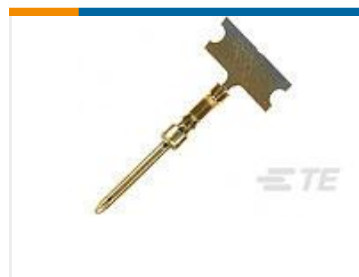
TE Part #745254-7 20 DF PIN CONT L.P.