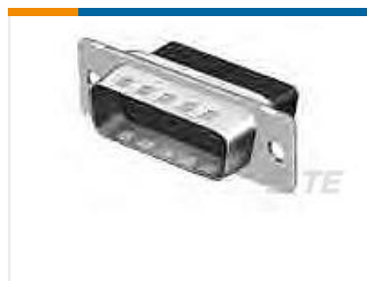
TE Part #205204-4 CRIMP SNAP PLUG ASSY,SIZE 1