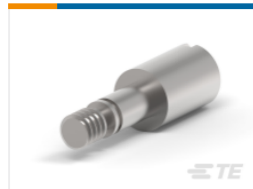
TE Part #1437012-5 609-002=HDW IDC JACKSCREW ASSY