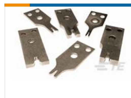
TE Part #1-234156-0 CRIMPER, WIRE SPECIAL