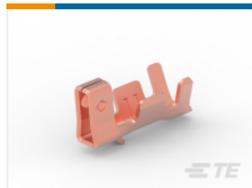
TE Part #2174065-4 REC. CONT. FMG. M-MOTOR PLUS