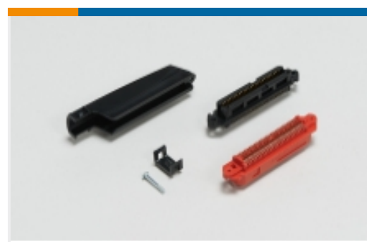
IDC D-Sub Connectors(36)