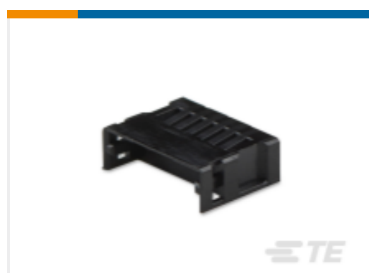
TE Part #2040974-2 PLUG HSG, 1.0VP REMODEL