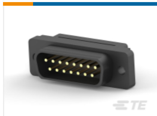
TE Part #1658608-1 IDC D-Sub: Plug Assembly, Low Profile, Signal, 2.77 mm