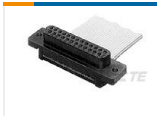
TE Part #1658614-1 37 POS HDF RCPT, AP, LEAD FREE