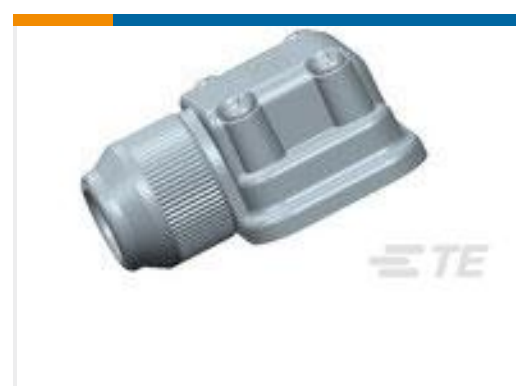
TE Part #2174054-1 ENC. CBL I/O KIT 100SET, M-MOTOR PLUS