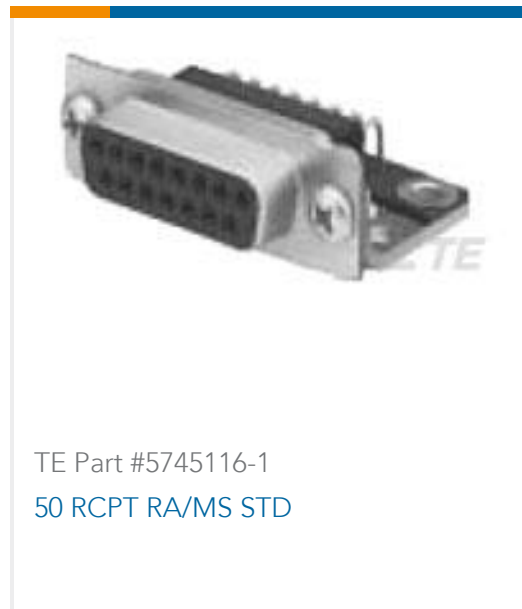
TE Part #5745116-1 50 RCPT RA/MS STD