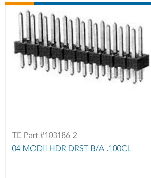
TE Part #103186-2 04 MODII HDR DRST B/A .100CL