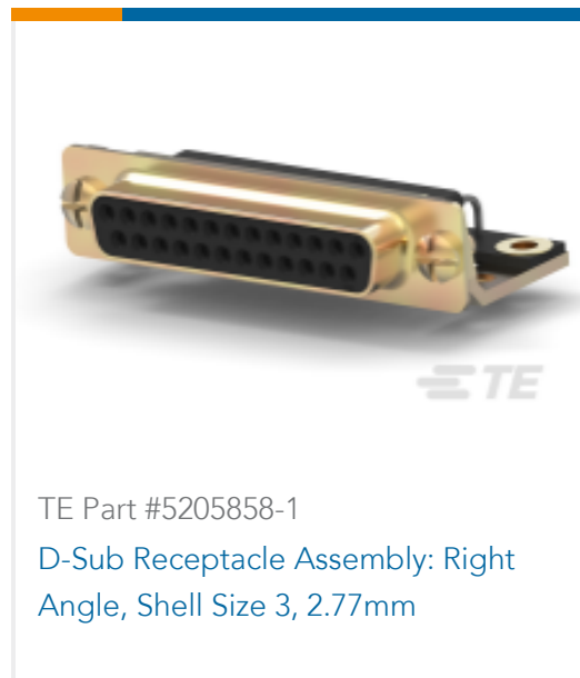
TE Part #5205858-1 D-Sub Receptacle Assembly: Right Angle, Shell Size 3, 2.77mm