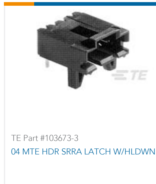
TE Part #103673-3 04 MTE HDR SRRA LATCH W/HLDWN