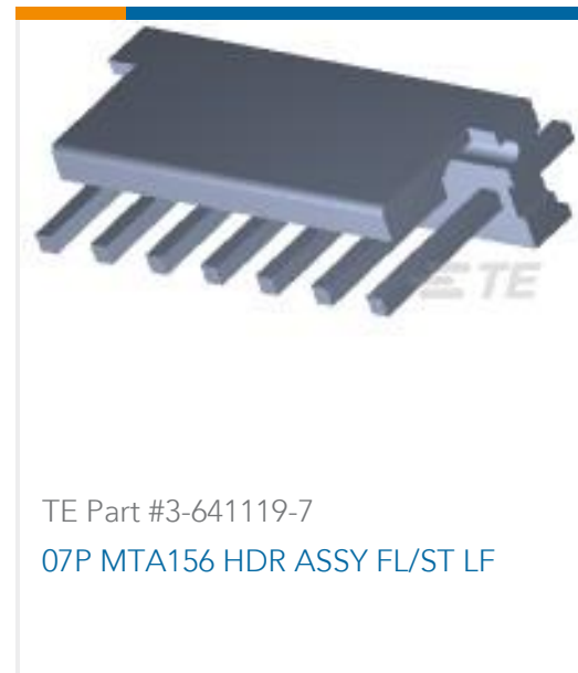
TE Part #3-641119-7 07P MTA156 HDR ASSY FL/ST LF