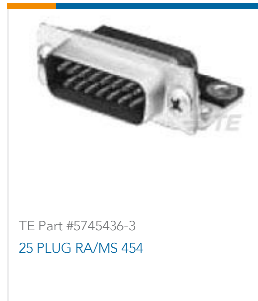
TE Part #5745436-3 25 PLUG RA/MS 454