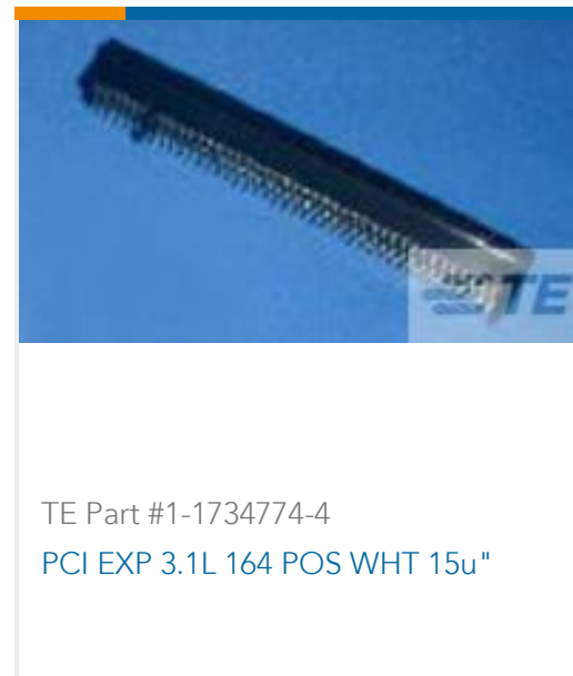
TE Part #1-1734774-4 PCI EXP 3.1L 164 POS WHT 15u"