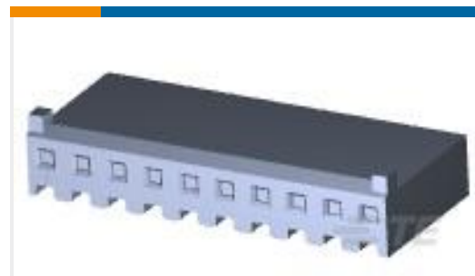
TE Part #1-770849-0 10P SL156 HSG W/LCK RMP & TABS