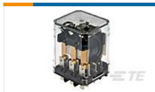
TE Part #3-1393117-0 KUP-11A55-24=KU