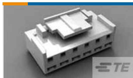
TE Part #1-1123722-4 3.96 EP PLUG HSG 4P(NATURAL)