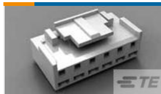
TE Part #1-1123722-6 3.96 EP PLUG HSG 6P(NATURAL)