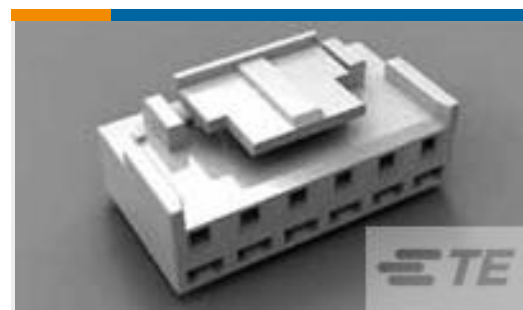
TE Part #1-1123722-3 3.96 EP PLUG HSG 3P(NATURAL)