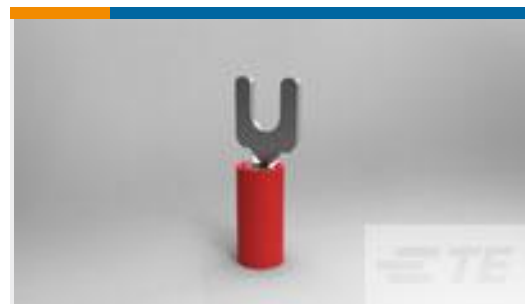
TE Part #2-34541-1 PIDG SPD 22-16 COMM 22-18MIL 6