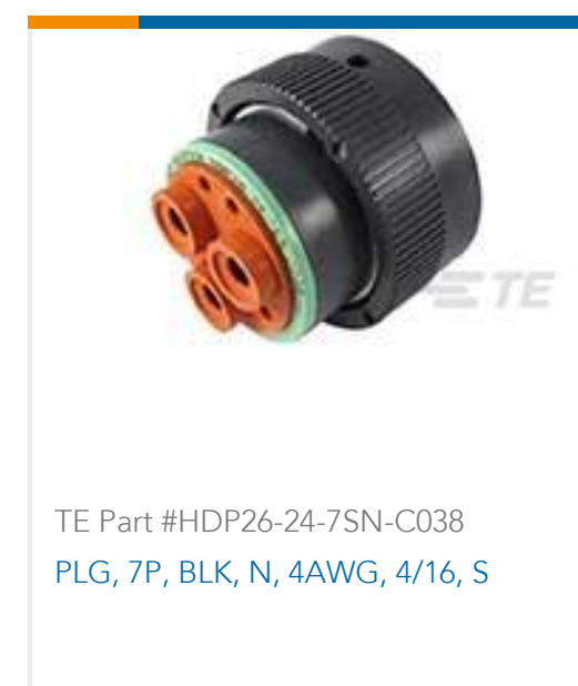
TE Part #HDP26-24-7SN-C038 PLG, 7P, BLK, N, 4AWG, 4/16, S