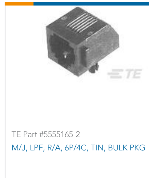
TE Part #5555165-2 M/J, LPF, R/A, 6P/4C, TIN, BULK PKG