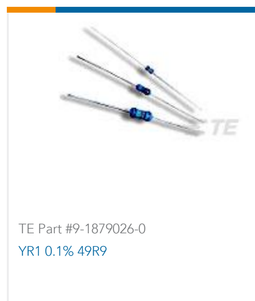
TE Part #9-1879026-0 YR1 0.1% 49R9