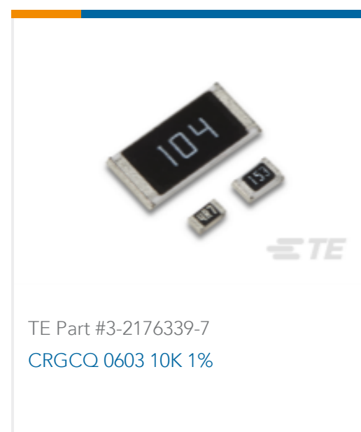
TE Part #3-2176339-7 CRGCO 0603 10K 1%