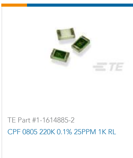
TE Part #1-1614885-2 CPF 0805 220K 0.1% 25PPM 1K RL