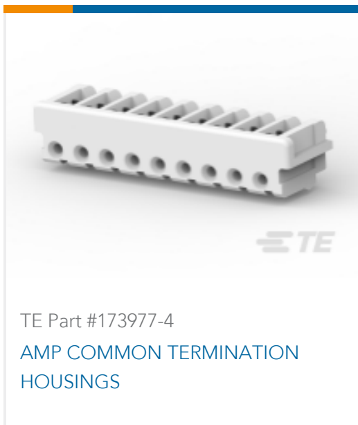
TE Part #173977-4 AMP COMMON TERMINATION HOUSINGS