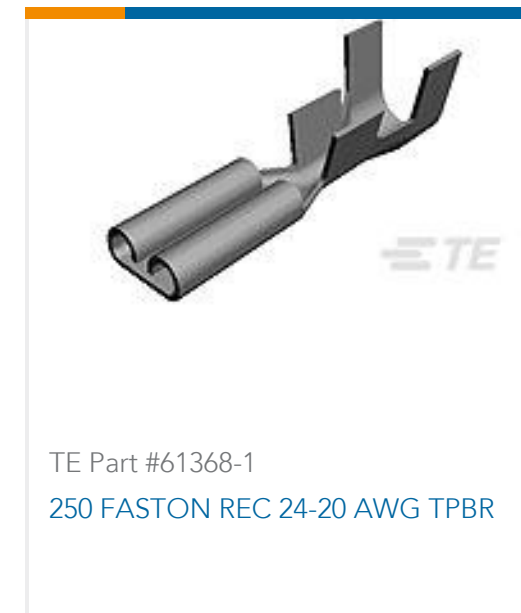
TE Part #61368-1 250 FASTON REC 24-20 AWG TPBR