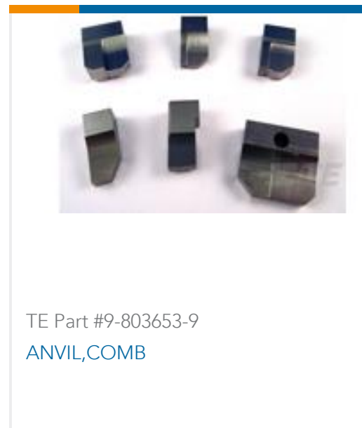
TE Part #9-803653-9 ANVIL,COMB