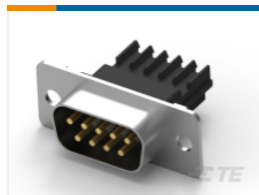
TE Part # CAT-AM7-248H3 IDC D-Sub: Plug Assembly, Wire to Wire, Signal, 2.77 mm