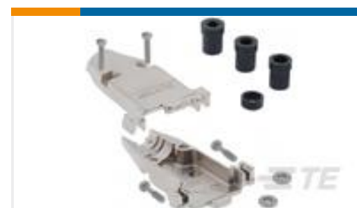
TE Part #5748676-1 DIE CAST CBL CLMP KIT,SZ 1