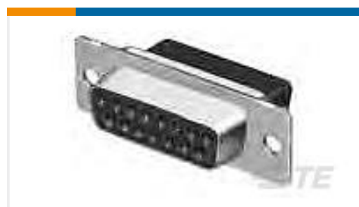
TE Part #205209-7 RECP ASSY SIZE 4