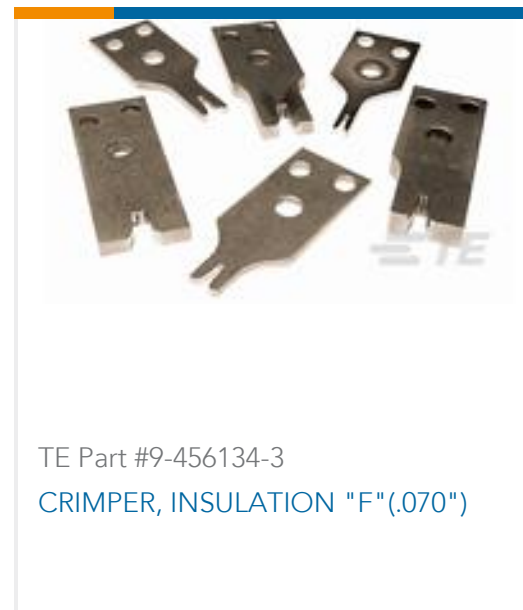
TE Part #9-456134-3 CRIMPER, INSULATION "F"(.070")