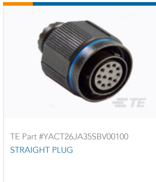
TE Part #YACT26JA35SBV00100 STRAIGHT PLUG