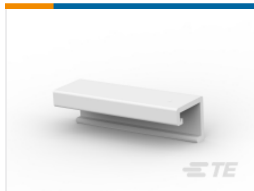
TE Part #640550-8 Polyester PCB Connector Covers: 2.54 mm, MTA 100