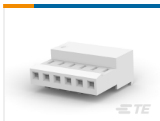
TE Part #3-641535-6 06P MTA100 CONN ASSY 24AWG