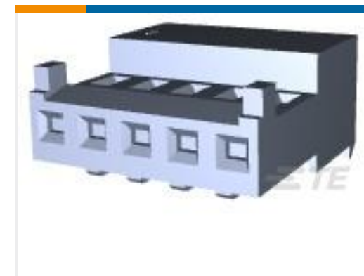
TE Part #3-644038-5 05P MTA100 CONN ASSY POL 15AU