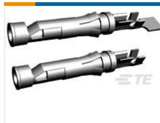
TE Part #66601-7 III+ SKT,18-14,TIN-LEAD,SMPACK