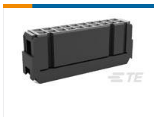
TE Part #1658620-5 24 NOVO MIL 15DP, LEAD FREE