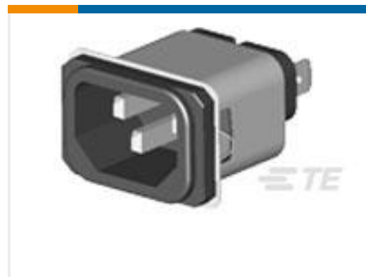
TE Part #2-6609987-4 15SRBS1-X=F8221E