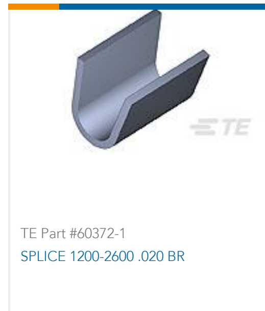
TE Part #60372-1 SPLICE 1200-2600 .020 BR