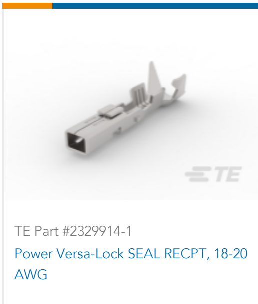
TE Part #2329914-1 Power Versa-Lock SEAL RECPT, 18-20 AWG