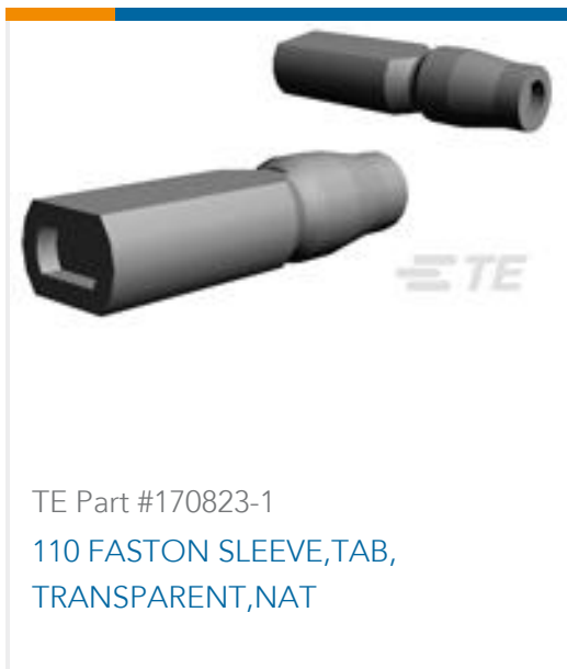
TE Part #170823-1 110 FASTON SLEEVE, TAB, TRANSPARENT, NAT