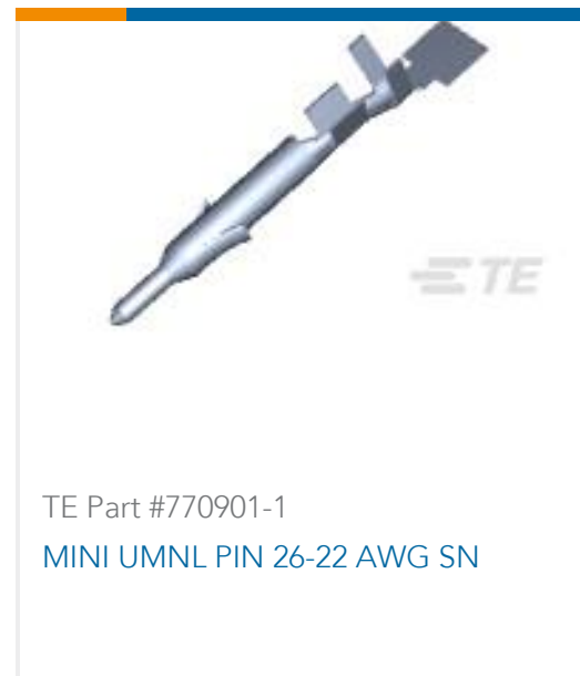
TE Part #770901-1 MINI UMNL PIN 26-22 AWG SN