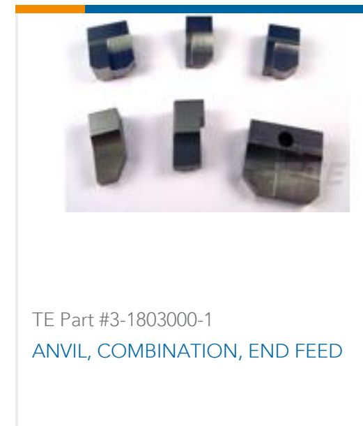
TE Part #3-1803000-1 ANVIL, COMBINATION, END FEED