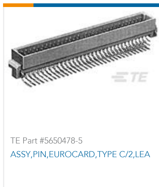
TE Part #5650478-5 ASSY,PIN,EUROCARD,TYPE C/2,LEA