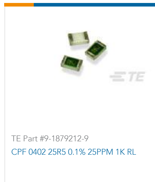
TE Part #9-1879212-9 CPF 0402 25R5 0.1% 25PPM 1K RL