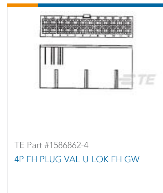
TE Part #1586862-4 4P FH PLUG VAL-U-LOK FH GW