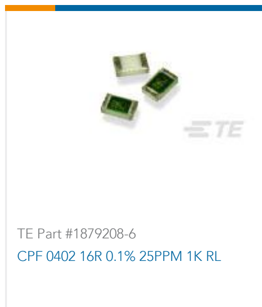
TE Part #1879208-6 CPF 0402 16R 0.1% 25PPM 1K RL