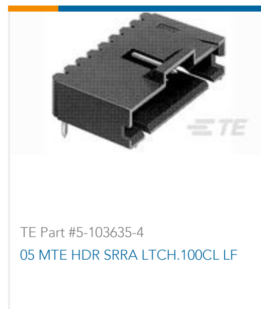
TE Part #5-103635-4 05 MTE HDR SRRA LTCH.100CL LF