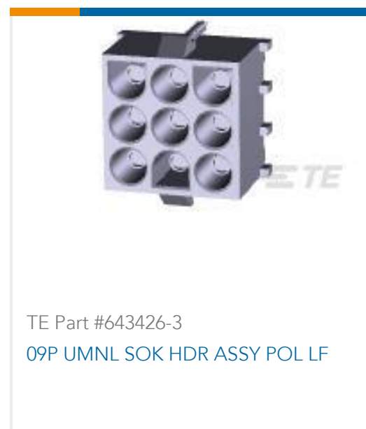
TE Part #643426-3 09P UMNL SOK HDR ASSY POL LF