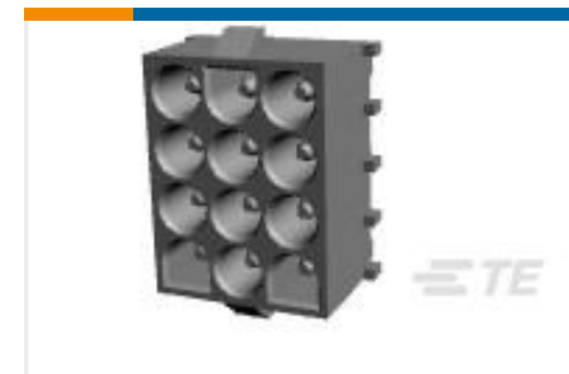
TE Part #350713-4 12P UMNL PIN HDR ASSY 94VO LF