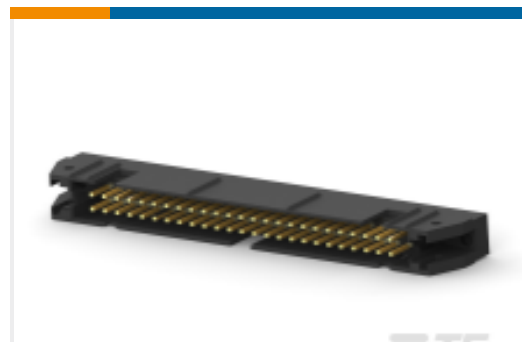
TE Part #5102321-9 AMP-LATCH UNIVERSAL HEADERS