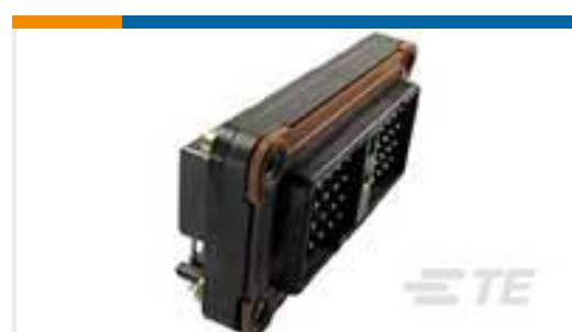
TE Part #DRC13-40PB HDR, 40P, BLK, RA, 1032 FLG, SN/NI /CU, B