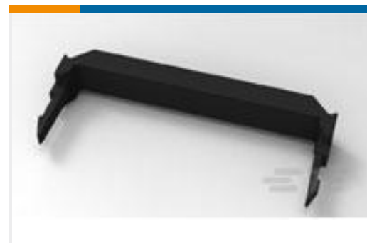
TE Part #499252-9 014 STRAIN RELIEF A-L RCPT