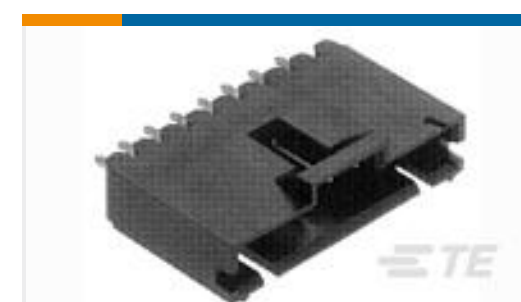
TE Part #103638-8 09 MTE HDR SRST LATCH .100CL