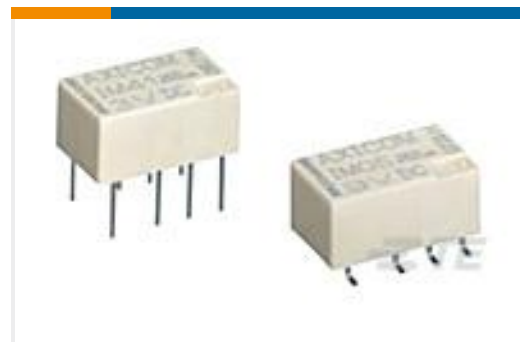
TE Part #1-1462039-8 IM06DGR=IM RELAY 140MW 12V