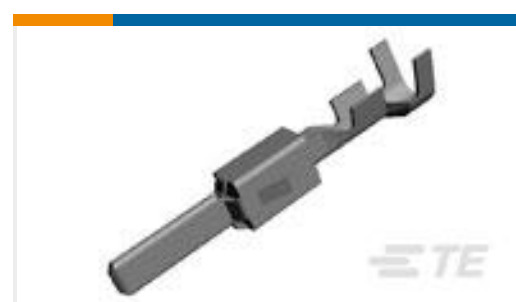
TE Part #1-968947-1 TAB 2.8x0.8 CONTACT CF SWS Sn