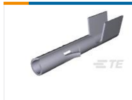
TE Part #350923-6 UMNL SOK 12-10 AUNI/PHBZ