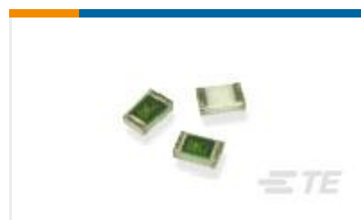
TE Part #1676667-2 RN 0805 21R5 0.1% 10PPM 1K RL