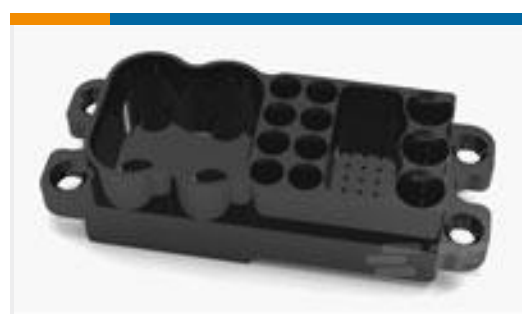
TE Part #1648552-1 295-0049-01100