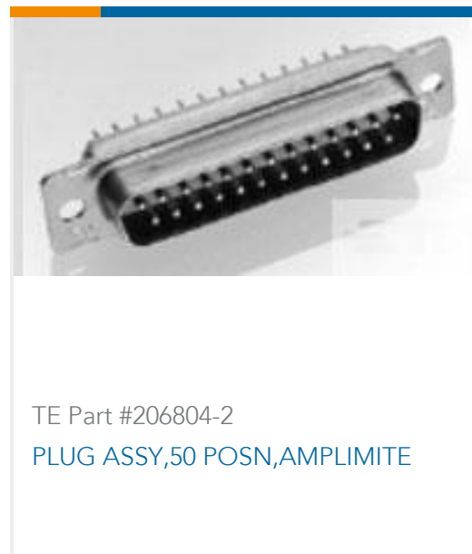
TE Part #206804-2 PLUG ASSY, 50 POSN, AMPLIMITE