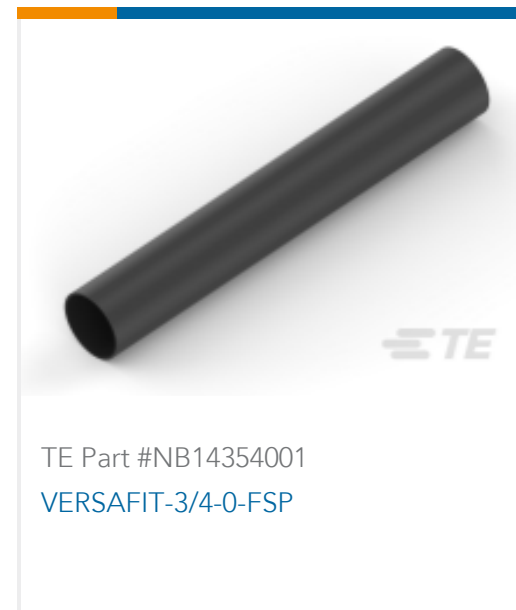
TE Part #NB14354001 VERSAFIT-3/4-0-FSP