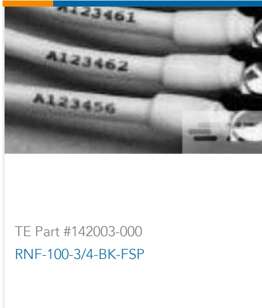
TE Part #142003-000 RNF-100-3/4-BK-FSP