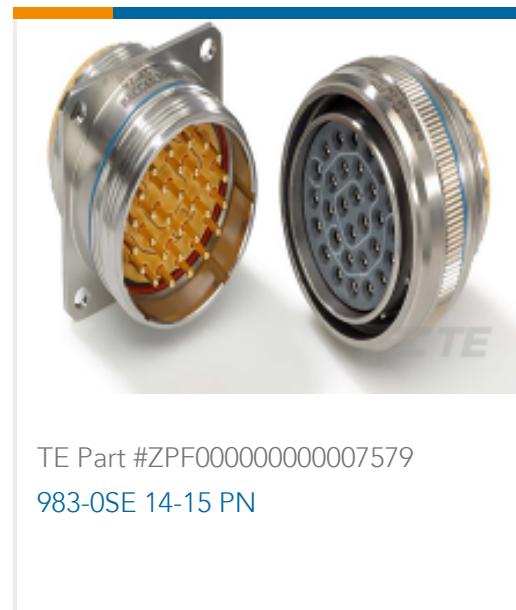
TE Part #ZPF000000000007579 983-0SE 14-15 PN