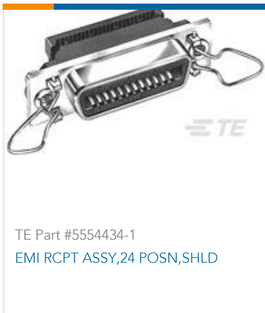
TE Part #5554434-1 EMI RCPT ASSY, 24 POSN, SHLD