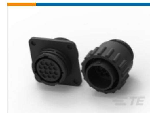
TE Part # CAT-AM71-C83998K CPC SERIES 6