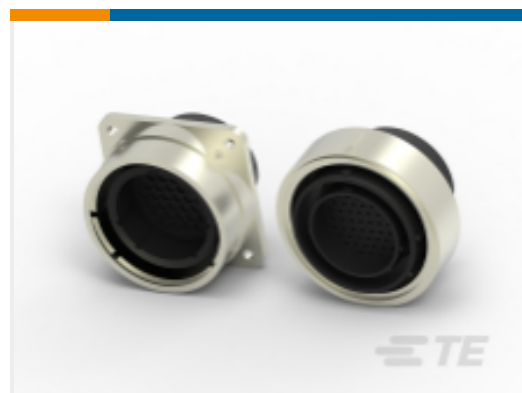
TE Part # CAT-AM71-C83998C CMC SERIES 1