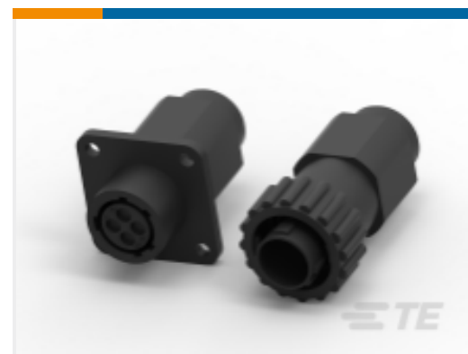
TE Part # CAT-AM71-C83998Y CPC SERIES 1 SEALED ONE-PIECE