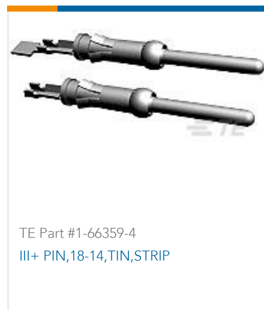
TE Part #1-66359-4 III+ PIN,18-14,TIN,STRIP