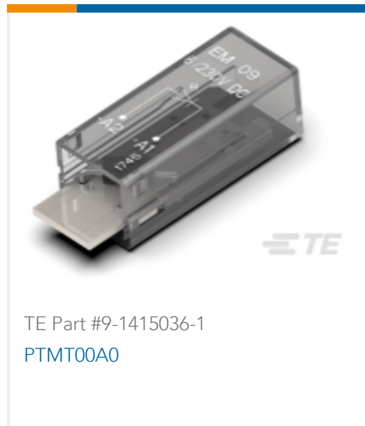
TE Part #9-1415036-1 PTMT00A0