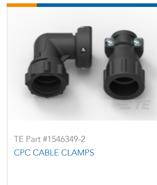
TE Part #1546349-2 CPC CABLE CLAMPS