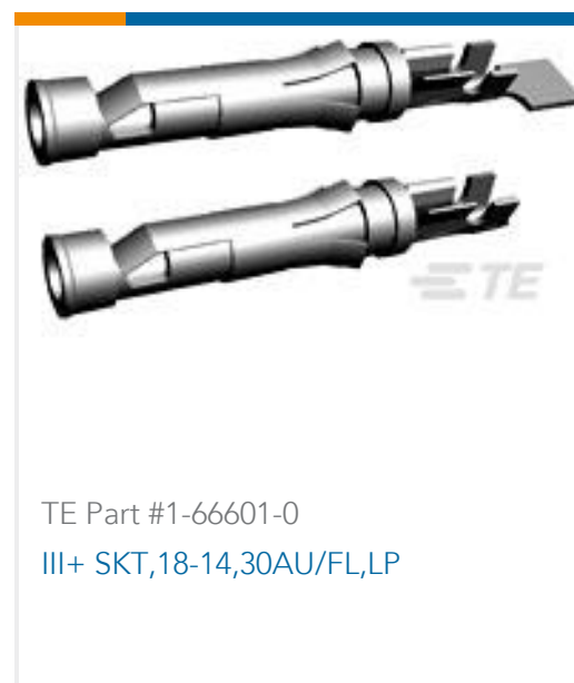
TE Part #1-66601-0 III+ SKT,18-14,30AU/FL,LP