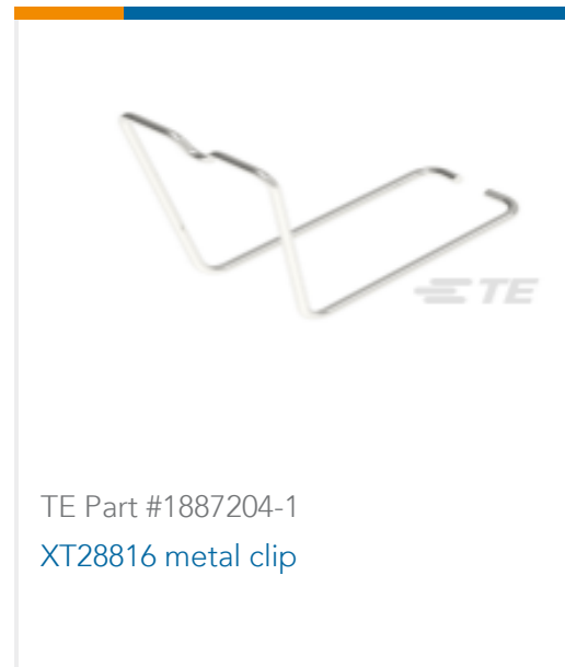
TE Part #1887204-1 XT28816 metal clip