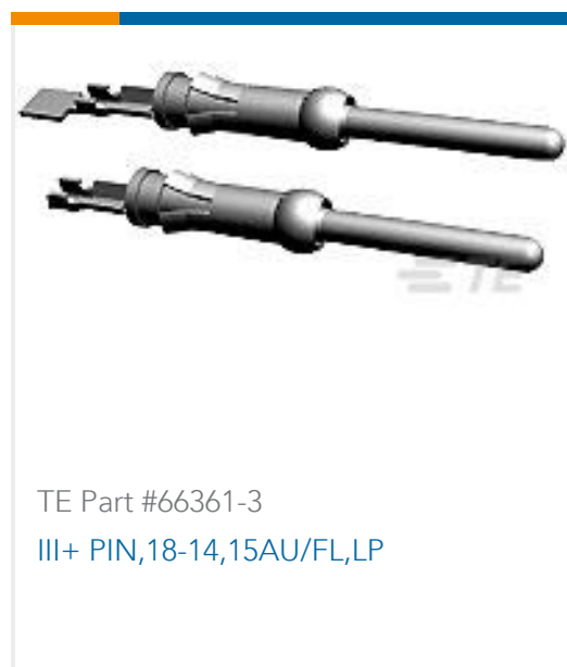
TE Part #66361-3 III+ PIN,18-14,15AU/FL,LP