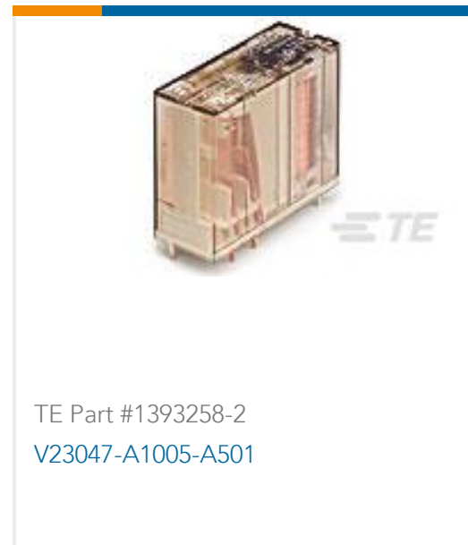
TE Part #1393258-2 V23047-A1005-A501