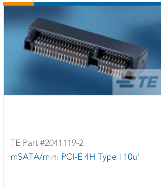
TE Part #2041119-2 mSATA/mini PCI-E 4H Type I 10u"