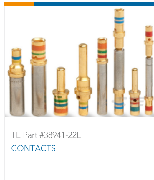
TE Part #38941-22L CONTACTS