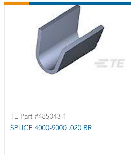
TE Part #485043-1 SPLICE 4000-9000 .020 BR