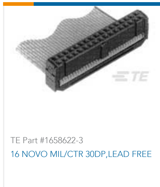
TE Part #1658622-3 16 NOVO MIL/CTR 30DP, LEAD FREE