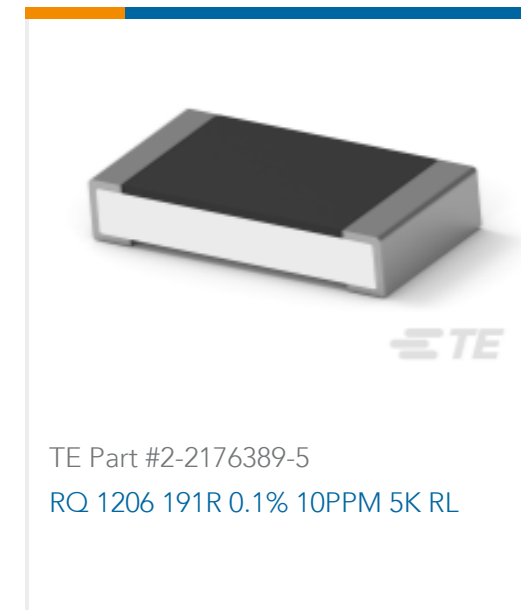
TE Part #2-2176389-5 RQ 1206 191R 0.1% 10PPM 5K RL