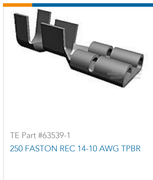
TE Part #63539-1 250 FASTON REC 14-10 AWG TPBR