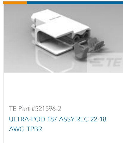
TE Part #521596-2 ULTRA-POD 187 ASSY REC 22-18 AWG TPBR