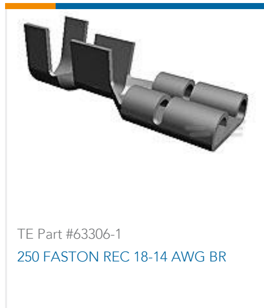
TE Part #63306-1 250 FASTON REC 18-14 AWG BR