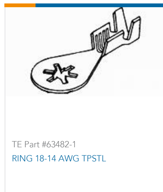
TE Part #63482-1 RING 18-14 AWG TPSTL