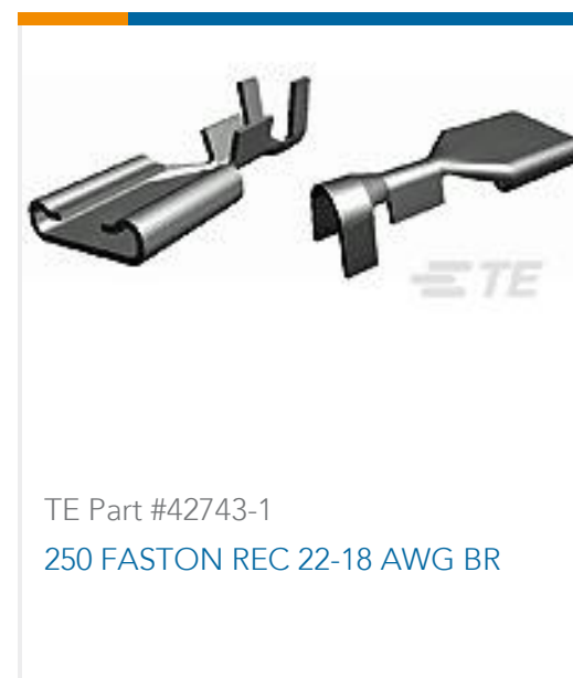
TE Part #42743-1 250 FASTON REC 22-18 AWG BR