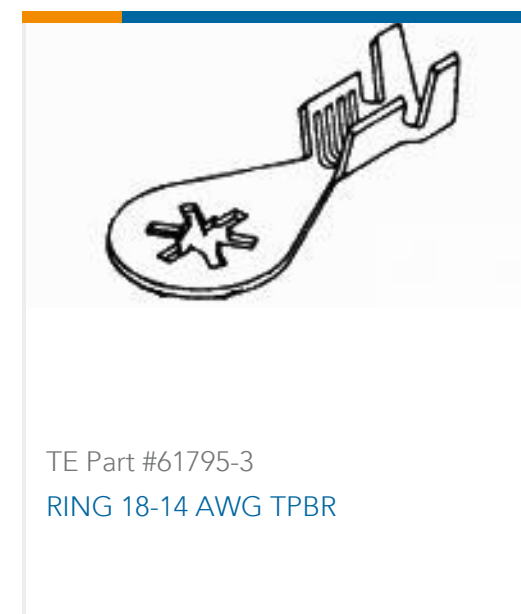
TE Part #61795-3 RING 18-14 AWG TPBR