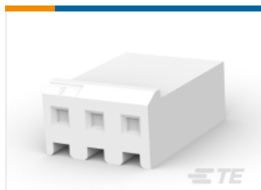
TE Part #640250-5 3.96mm Wire-to-board housing: receptacle, with mating alignment, SL 156