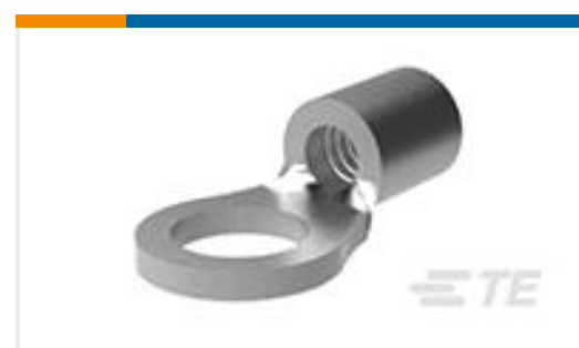
TE Part #2-35771-1 TERMINAL,SOLIS R 12-10 10