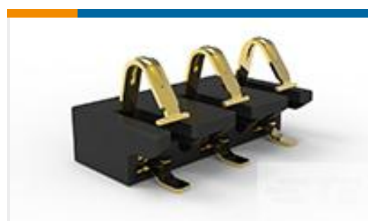
TE Part #292331-3 BATTERY 3P SMT 1.6MM PITCH ASSEMBLY CONN