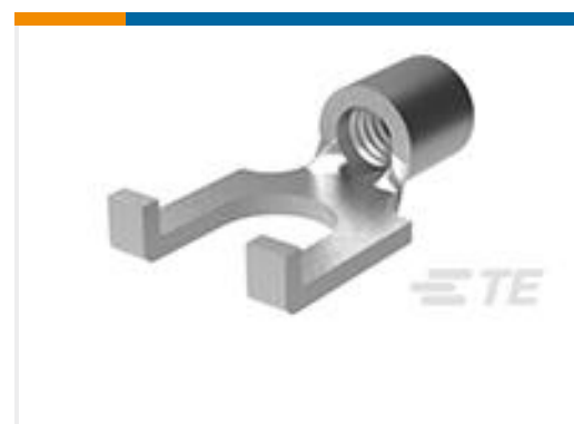
TE Part #2-323144-1 TERMINAL,SOLIS SPD FLG 12-10