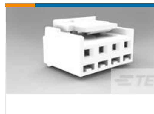
TE Part #1-1744416-0 10 POS EP II HSG, GLOW WIRE