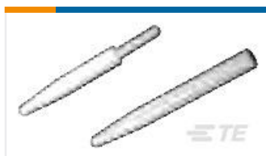
TE Part #208337-1 SEAL PROTECTOR PIN