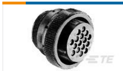
TE Part #183073-1 PLUG ASS'Y 23-24STD.SEX SRS.