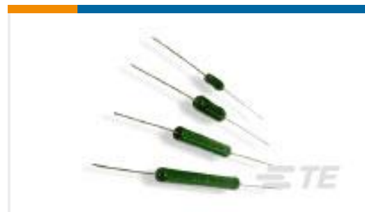
TE Part #3-1623774-0 C14 33R 5% (LOOSE)