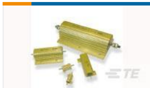
TE Part #2-1630012-5 HSC150 R47 5%