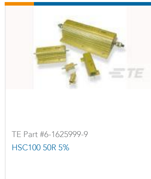
TE Part #6-1625999-9 HSC100 50R 5%