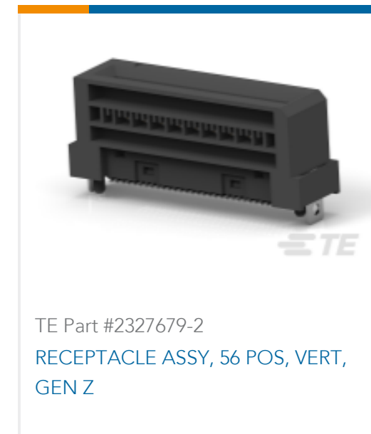
TE Part #2327679-2 RECEPTACLE ASSY, 56 POS, VERT, GEN Z