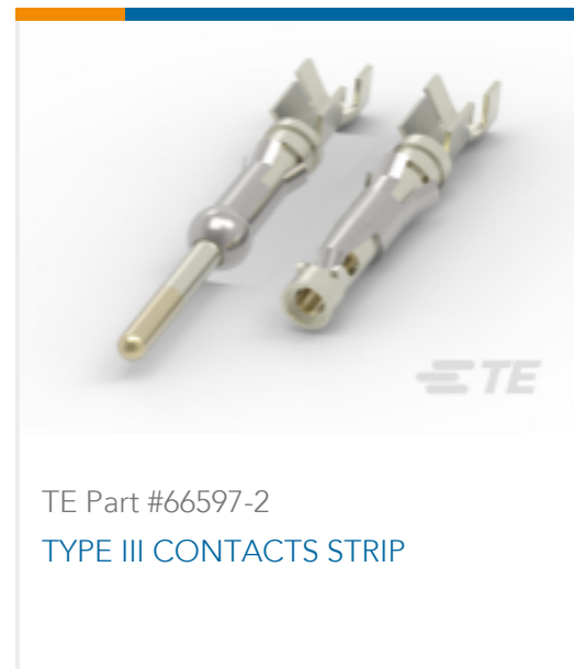
TE Part #66597-2 TYPE III CONTACTS STRIP