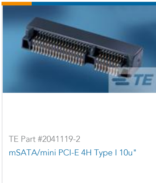
TE Part #2041119-2 mSATA/mini PCI-E 4H Type I 10u"