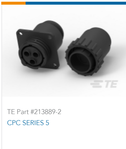
TE Part #213889-2 CPC SERIES 5