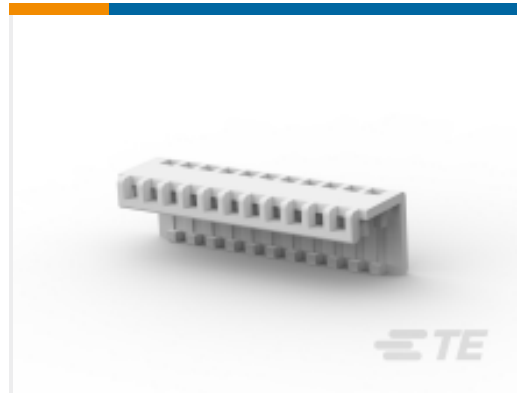
TE Part #643077-2 Nylon PCB Connector Covers: 2.54 mm, MTA 100