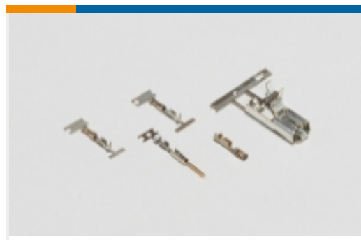
Wire-to-Board Connector Contacts(18)