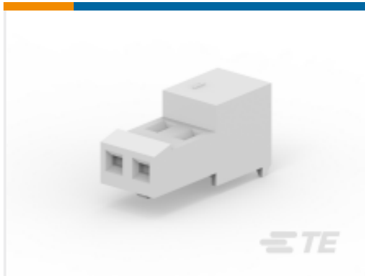
TE Part #3-640621-6 Nylon Tin Plated Receptacle: 2.54mm, No Mating Alignment, MTA 100