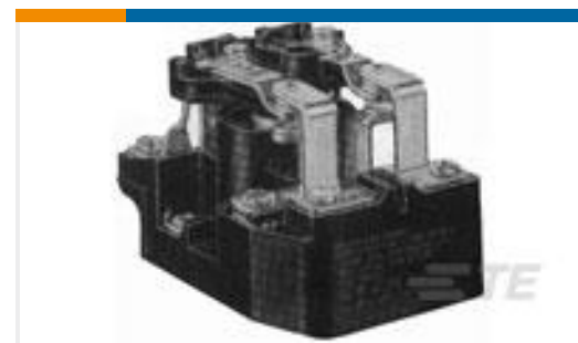
TE Part #1393128-5 PRD-5AY0-120=PRD