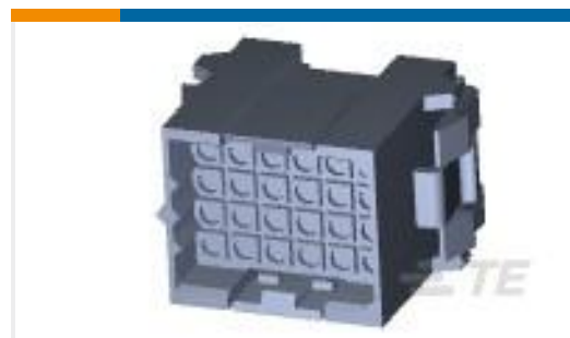
TE Part #207305-1 24 POS SQ GRID METRIMATE-RCPT