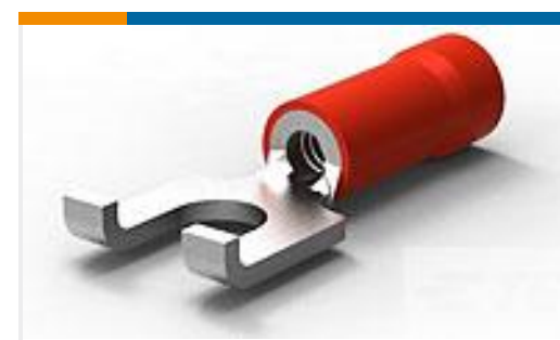
TE Part #322249 PG SPDFLG 22-16COMM 22-18MIL 6