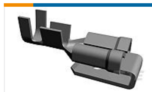
TE Part #62026-2 187 FASTON REC 20-16 AWG BR