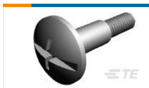
TE Part #208211-4 SCREW, SHOULDER, SPECIAL