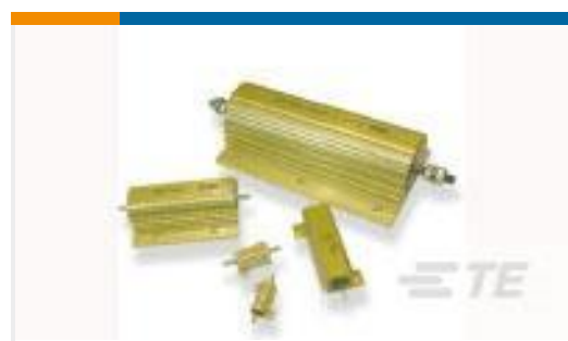
TE Part #1676625-8 HSA25 75R 5%