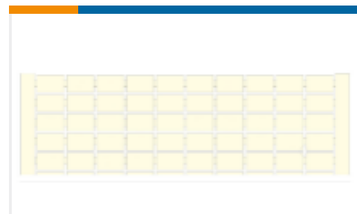
TE Part #1SNA233062R2200 RC610 201->300 VERTICAL