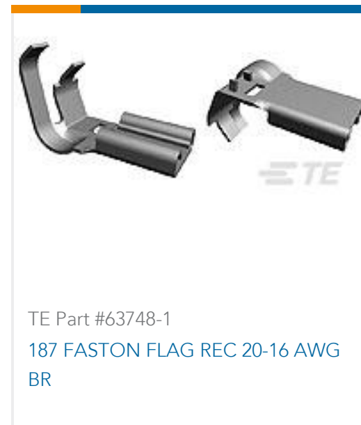
TE Part #63748-1 187 FASTON FLAG REC 20-16 AWG BR