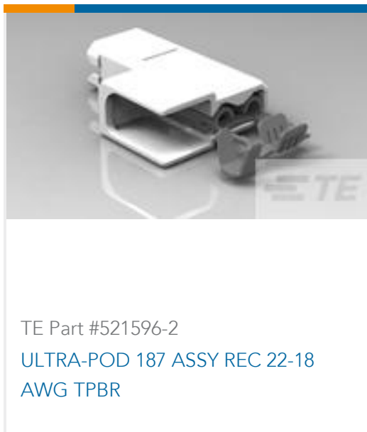
TE Part #521596-2 ULTRA-POD 187 ASSY REC 22-18 AWG TPBR