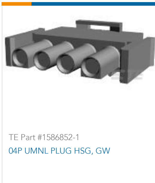
TE Part #1586852-1 04P UMNL PLUG HSG, GW