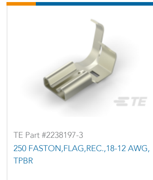
TE Part #2238197-3 250 FASTON, FLAG, REC., 18-12 AWG, TPBR