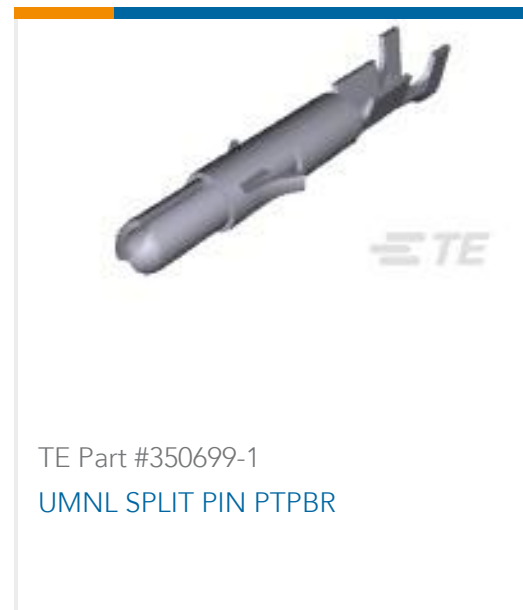
TE Part #350699-1 UMNL SPLIT PIN PTPBR